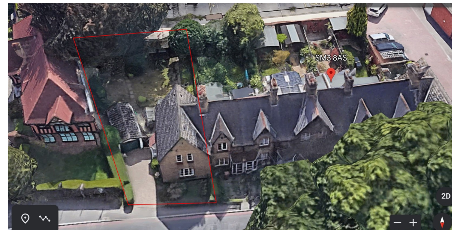
Aerial view shows the existing garage which has approval to be demolished.