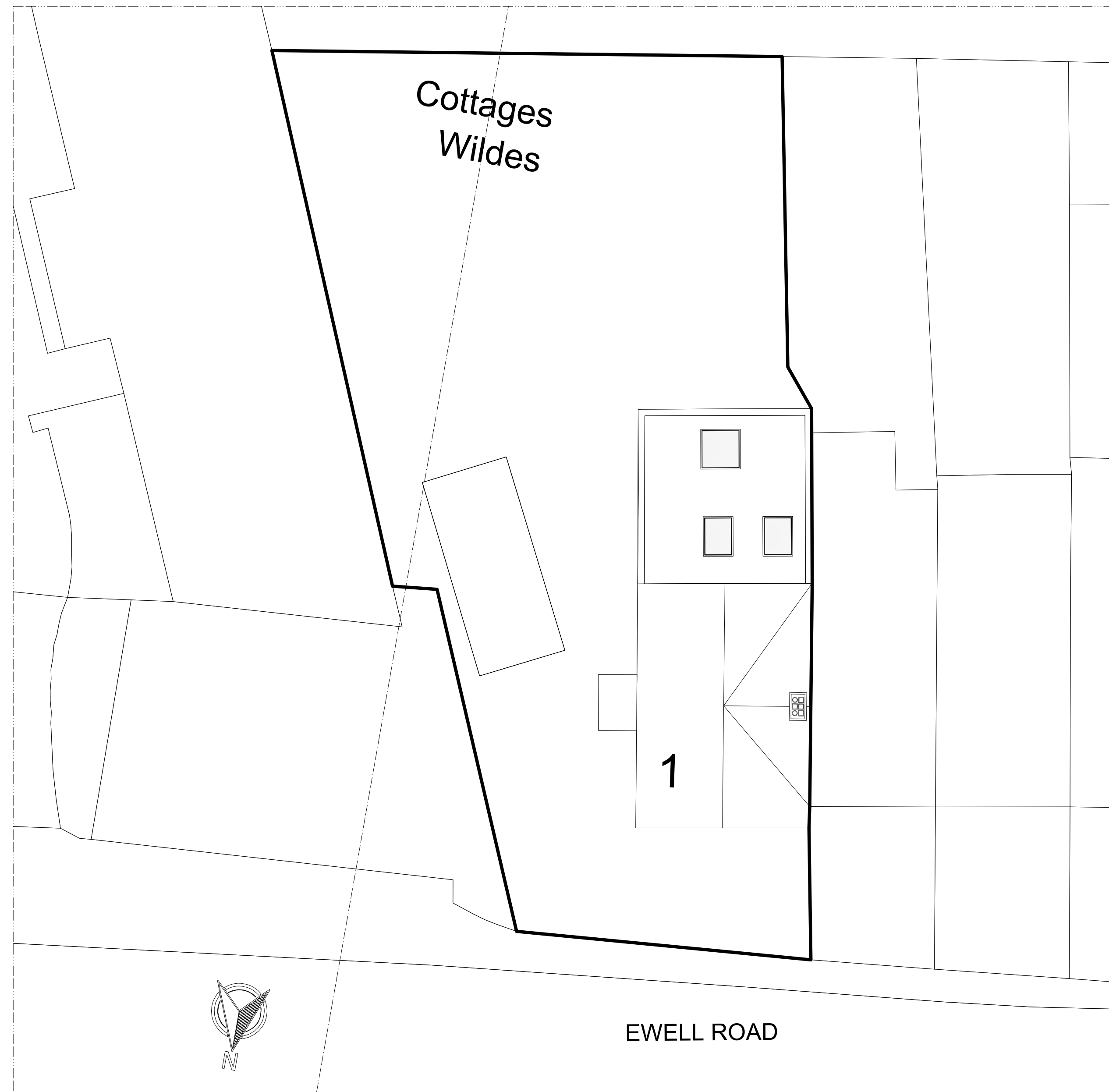
2 Existing Block Plan Scale: 1:100