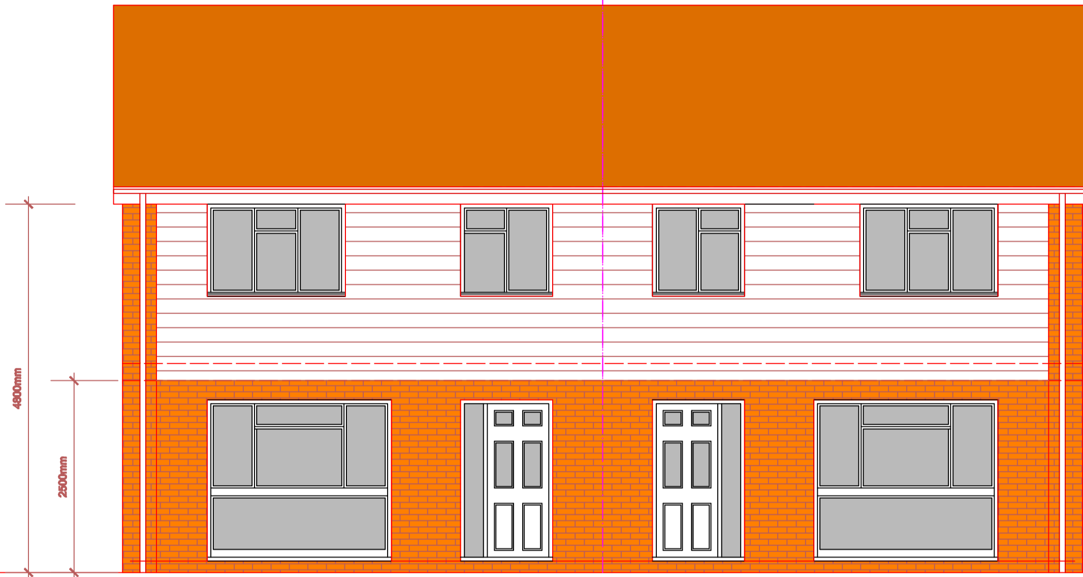
FRONT (STREET) ELEVATION

NOTES 1: This drawing is copyright © 2023 2: All dimensions to be checked and confirmed on site. 3: This drawing is not to be scaled. 4: All work and materials to be in accordance with the current Building Regulations and to comply with all the relevant codes of practice and where applicable the current edition of the relevant British Standard.