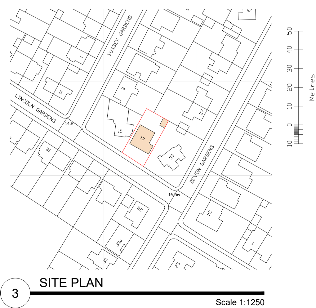
3 SITE PLAN Scale 1:1250