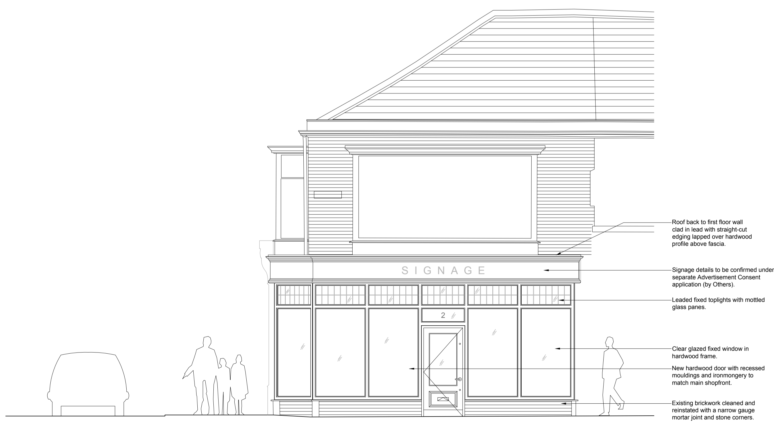
EDWARD STREET ELEVATION