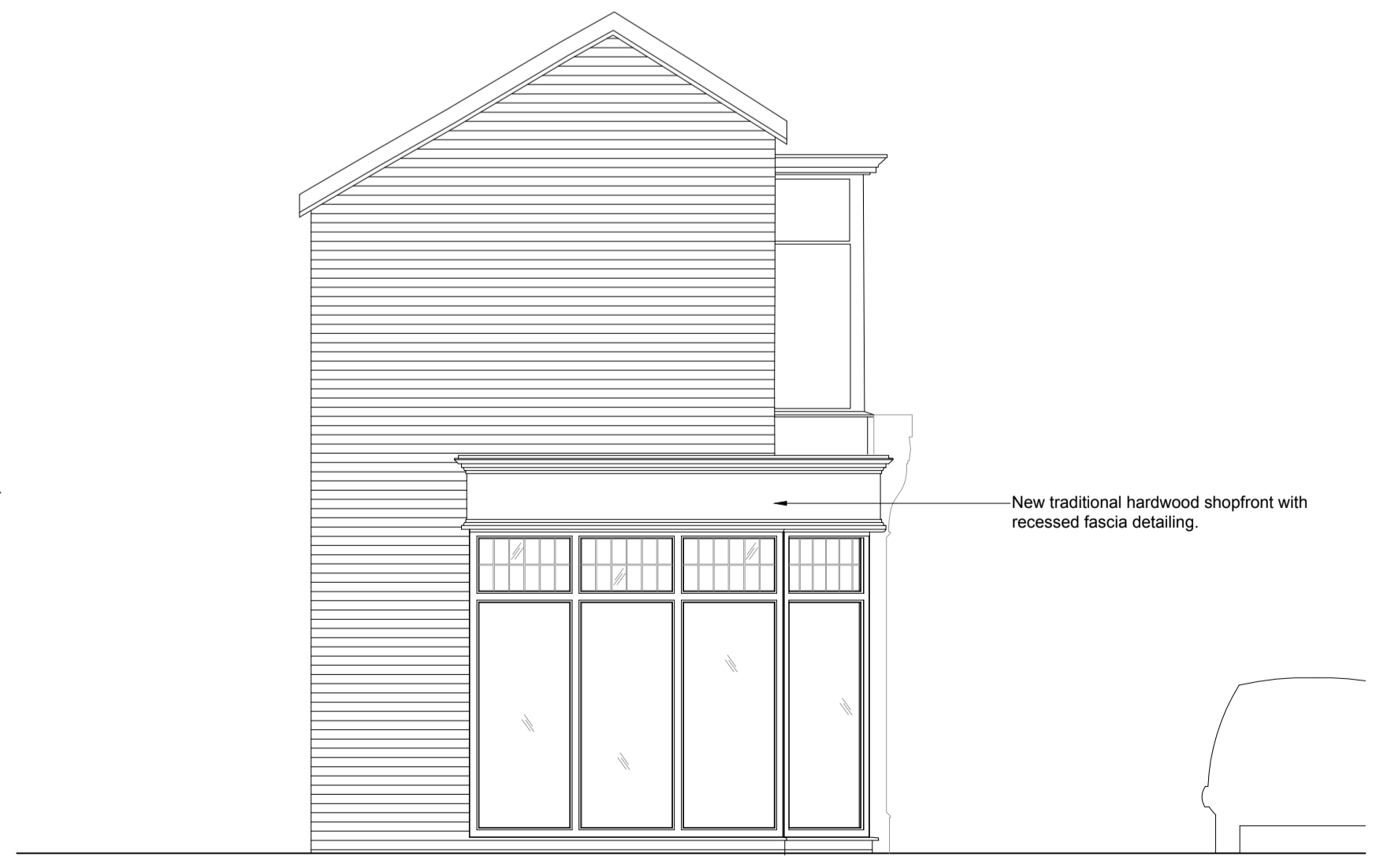
BACK DEANSGATE ELEVATION

New traditional hardwood shopfront with recessed fascia detailing.