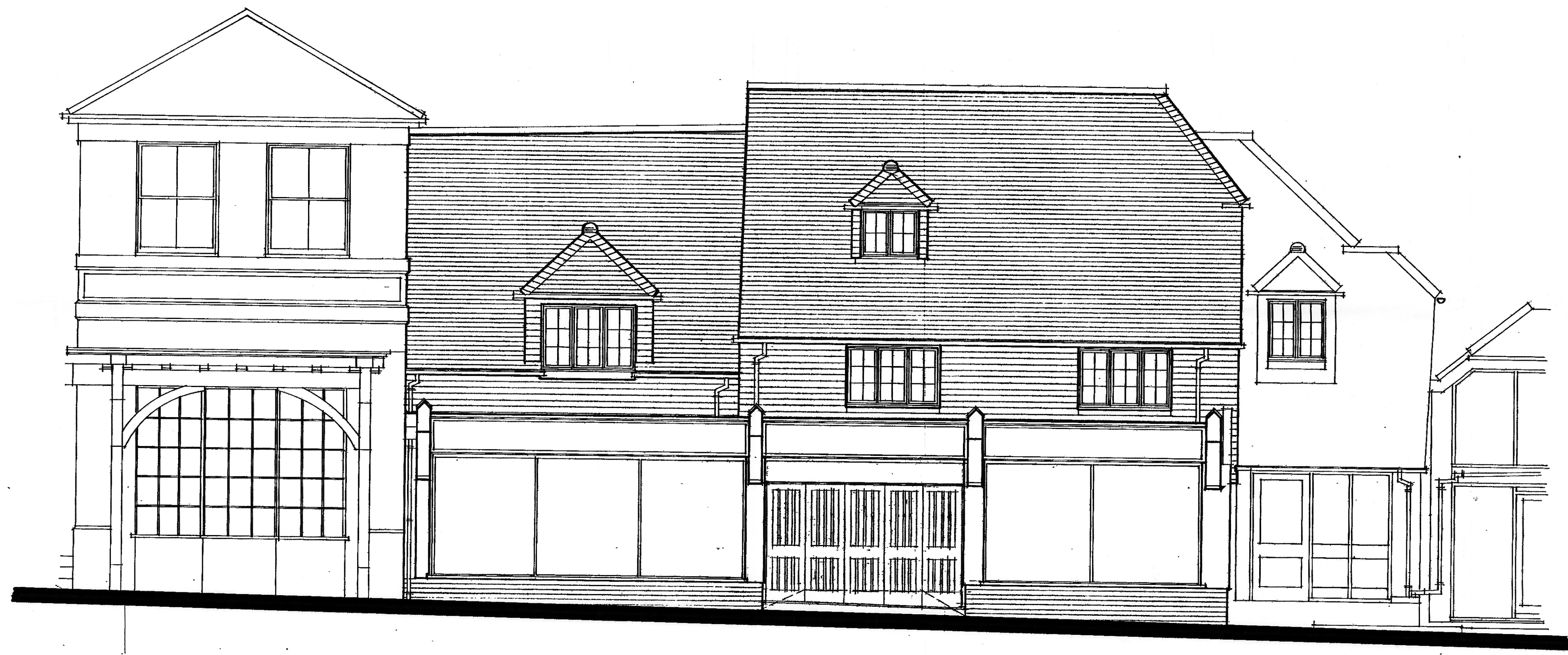
London Road existing elevation