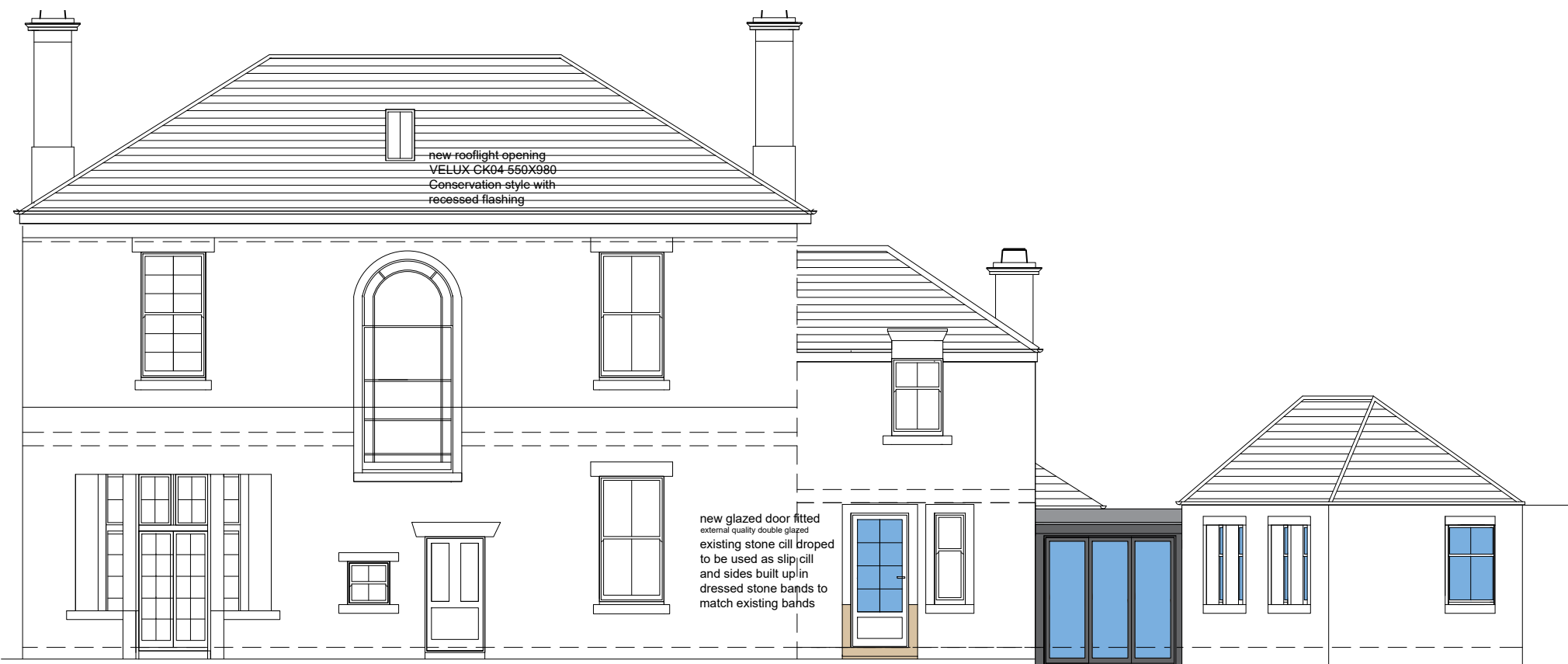
PROPOSED REAR WEST ELEVATION