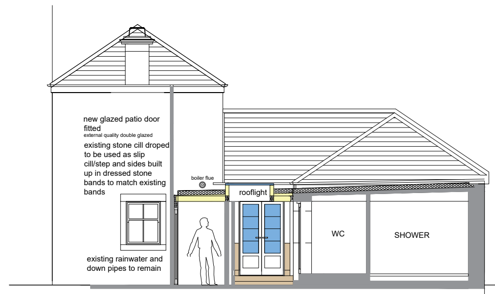
PROPOSED SECTION NEW DOORS COURTYARD