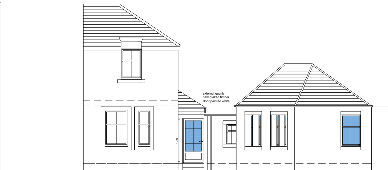
PROPOSED ELEVATION NEW DOOR COURTYARD