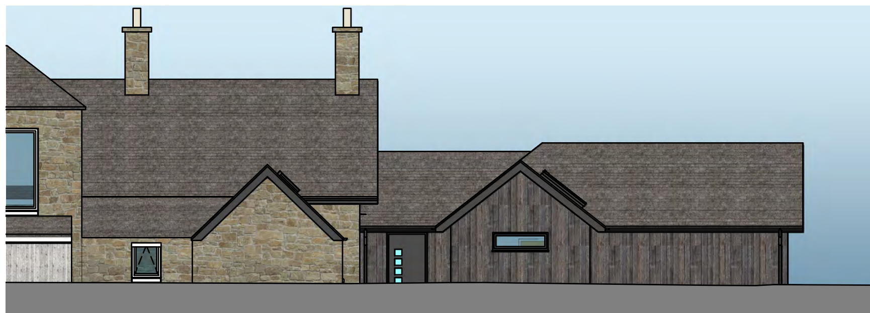
3 North Elevation (from road) Scale: 1:100 (north fence not shown)