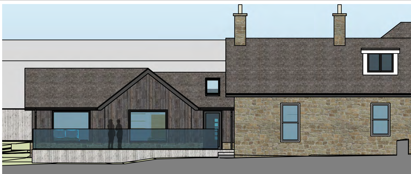
1 South Elevation Scale: 1:100

Larch fence to north (1.8m high) and west boundary (1.2m high).