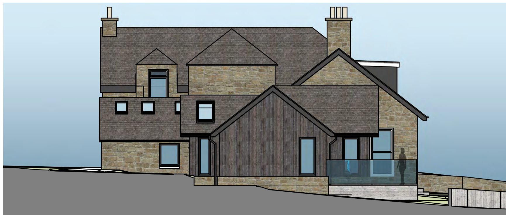
2 West Elevation Scale: 1:100 (north fence not shown)