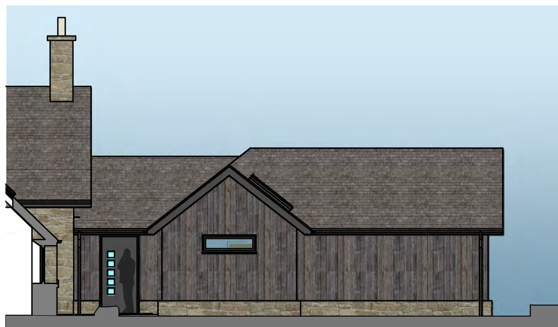
4 North Elevation (from path) Scale: 1:100