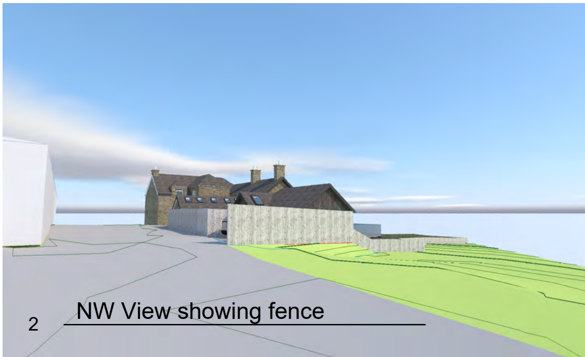
2 NW View showing fence