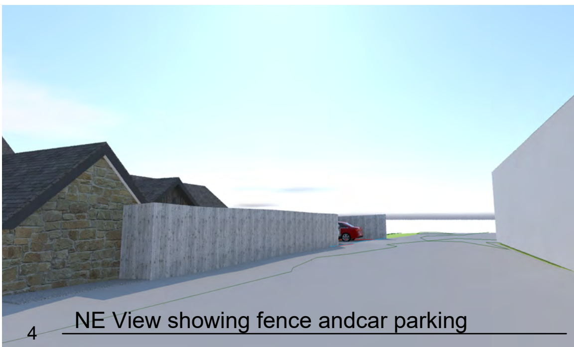
4 NE View showing fence and car parking