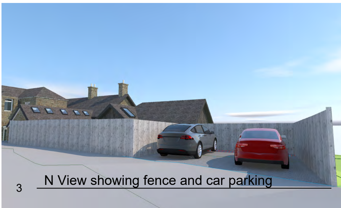
3 N View showing fence and car parking