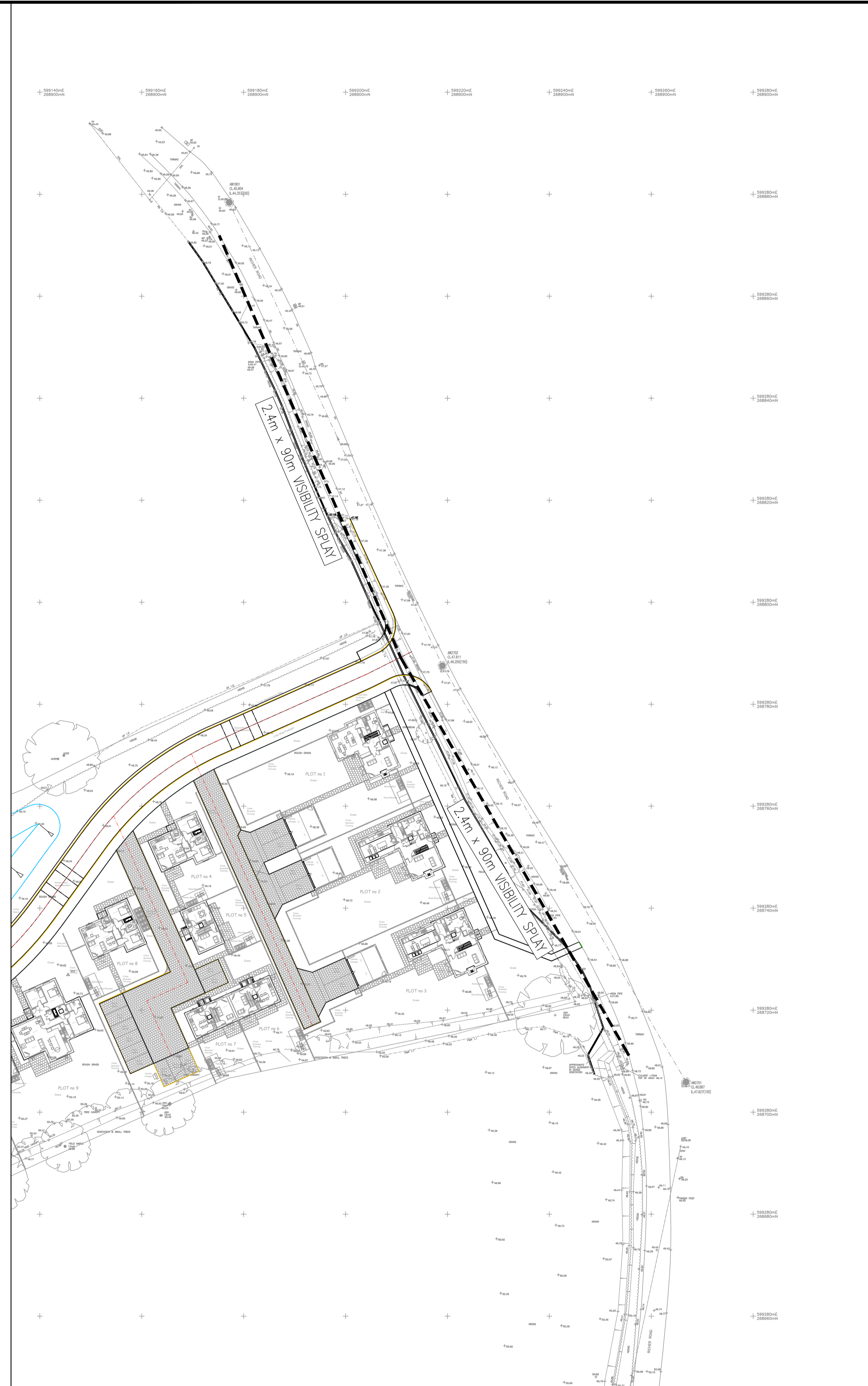
VISIBILITY SPLAYS SCALE 1:500