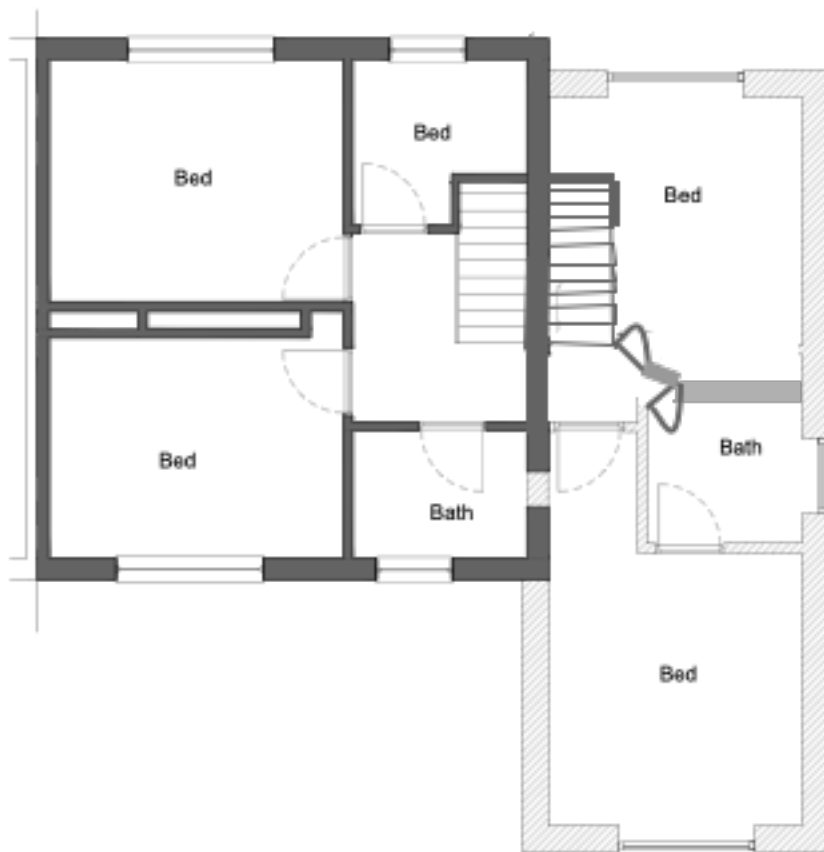
PROPOSED FIRST FLOOR 1:100