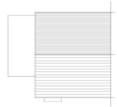
EXISTING ROOF PLAN 1:200