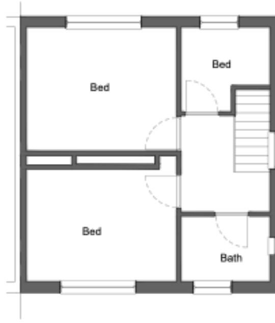
EXISTING FIRST FLOOR 1:100