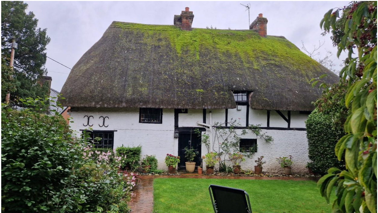
Rear view of existing building with timber framing