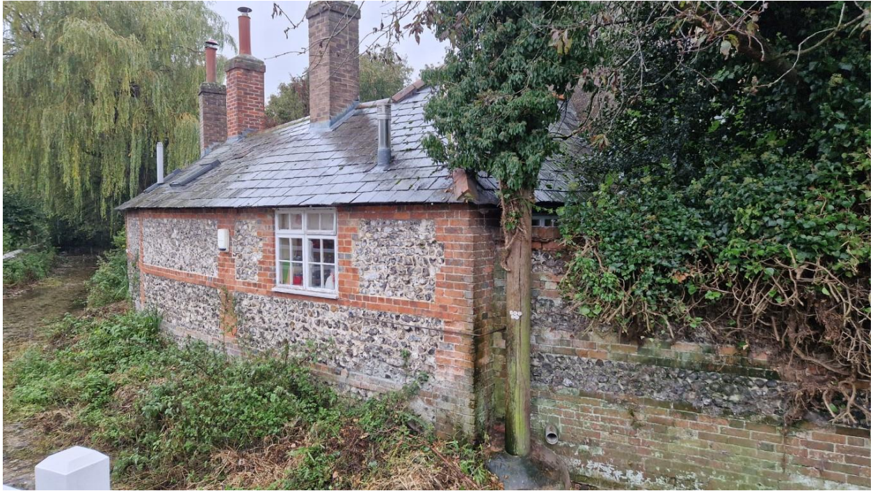
Existing brick and flint outbuilding abutting watercourse