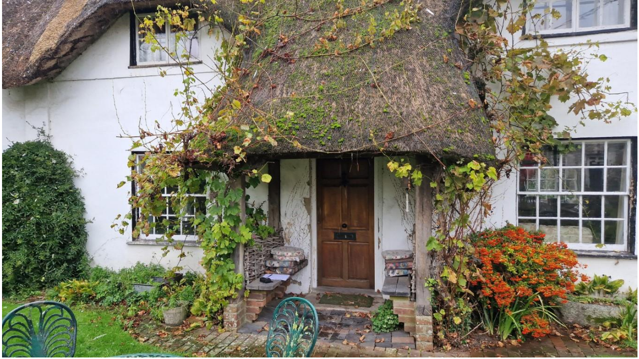
Existing front entrance