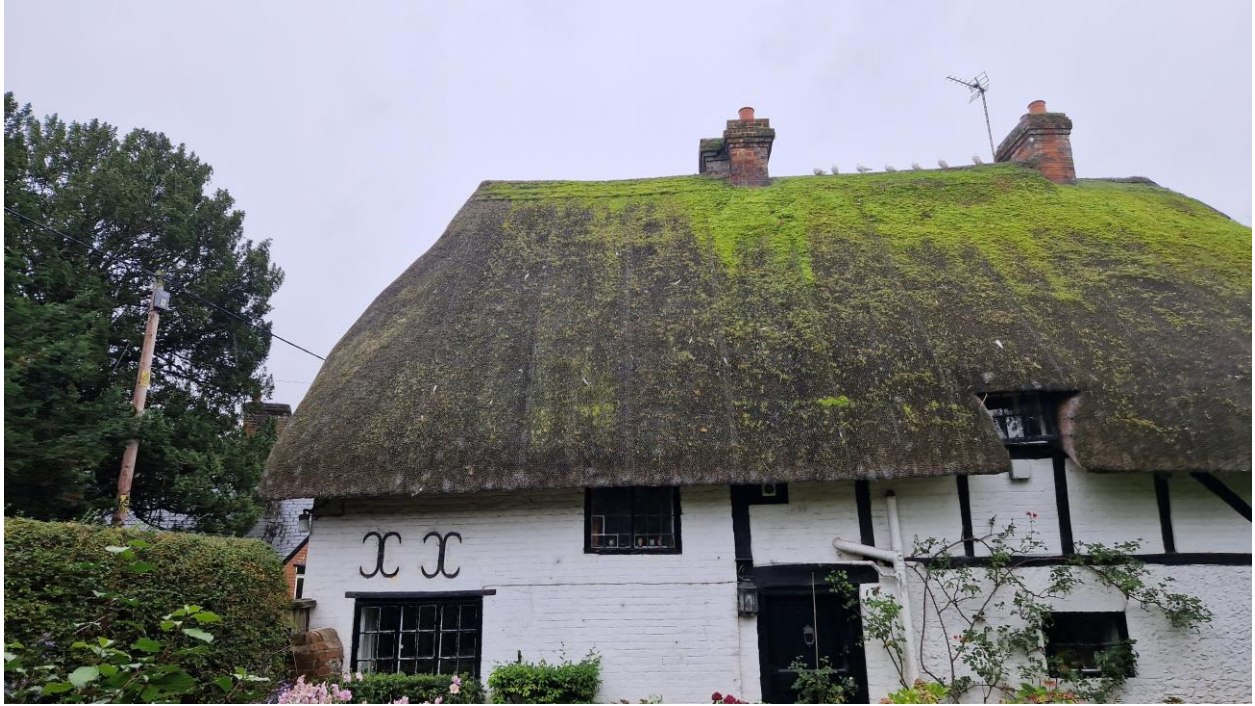
Existing chimneys at Summerhaugh