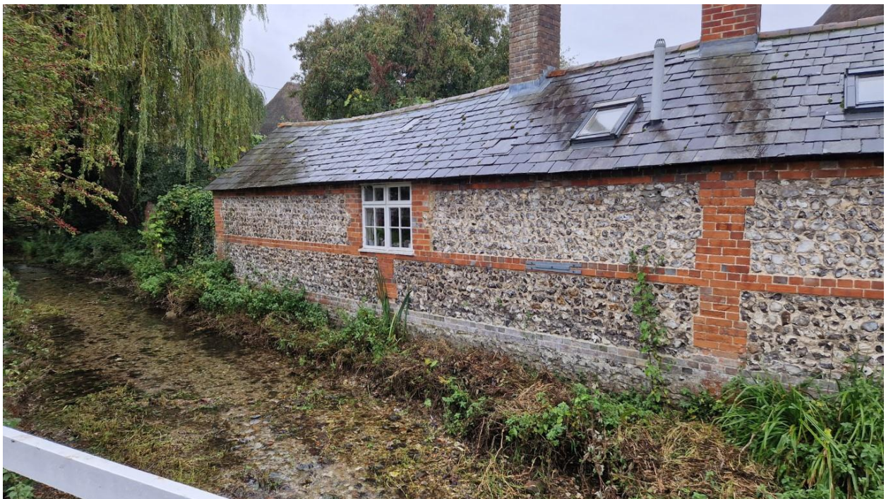
Existing converted outbuilding