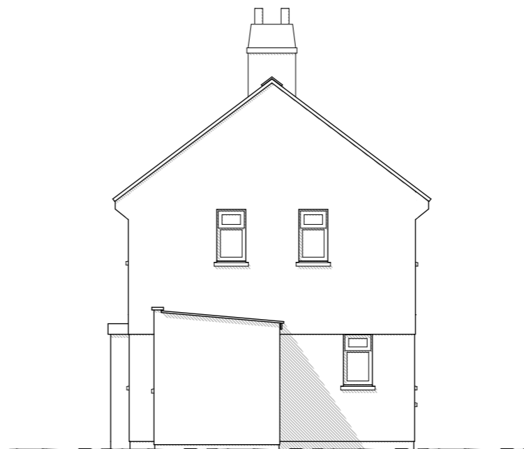
NE (SIDE) ELEVATION 1:100