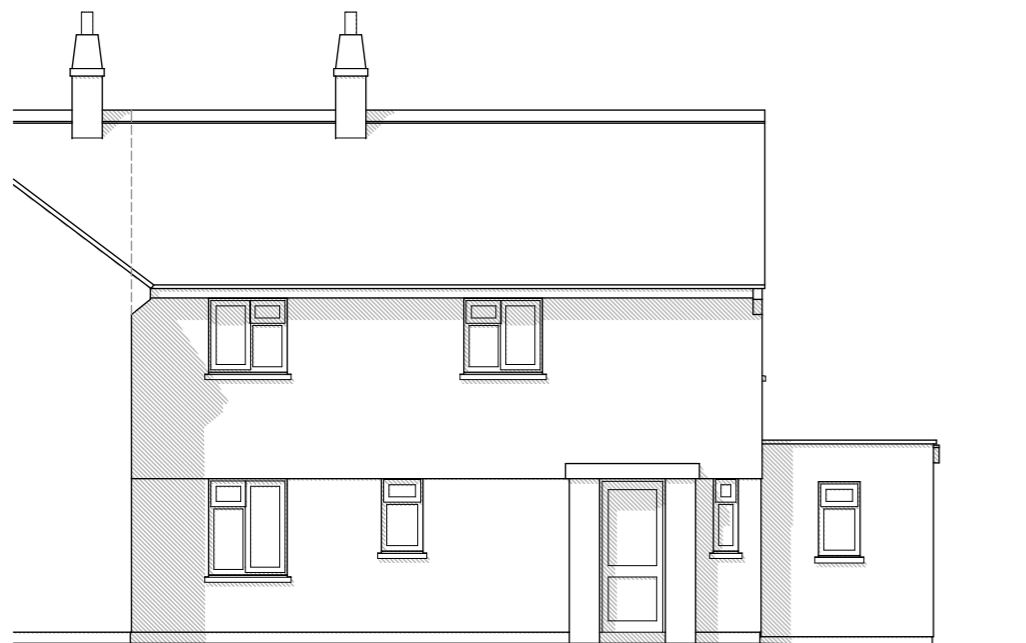
SE (FRONT) ELEVATION 1:100