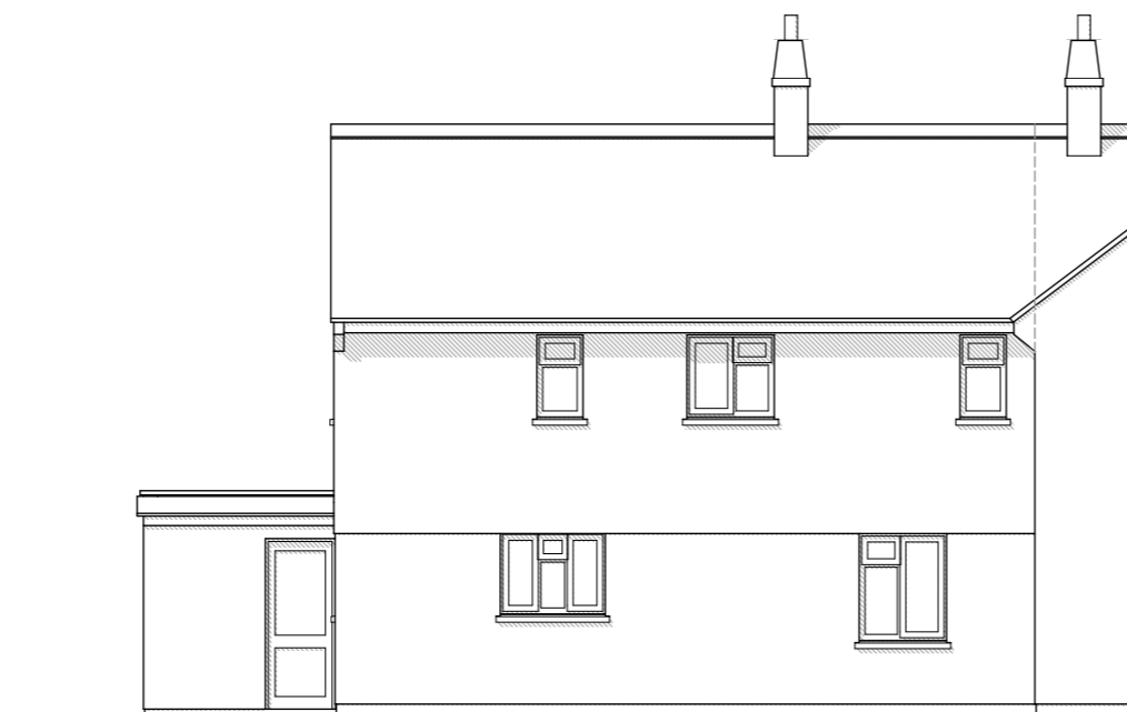
NW (REAR) ELEVATION 1:100