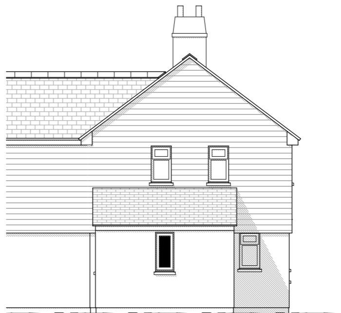
NE (SIDE) ELEVATION 1:100