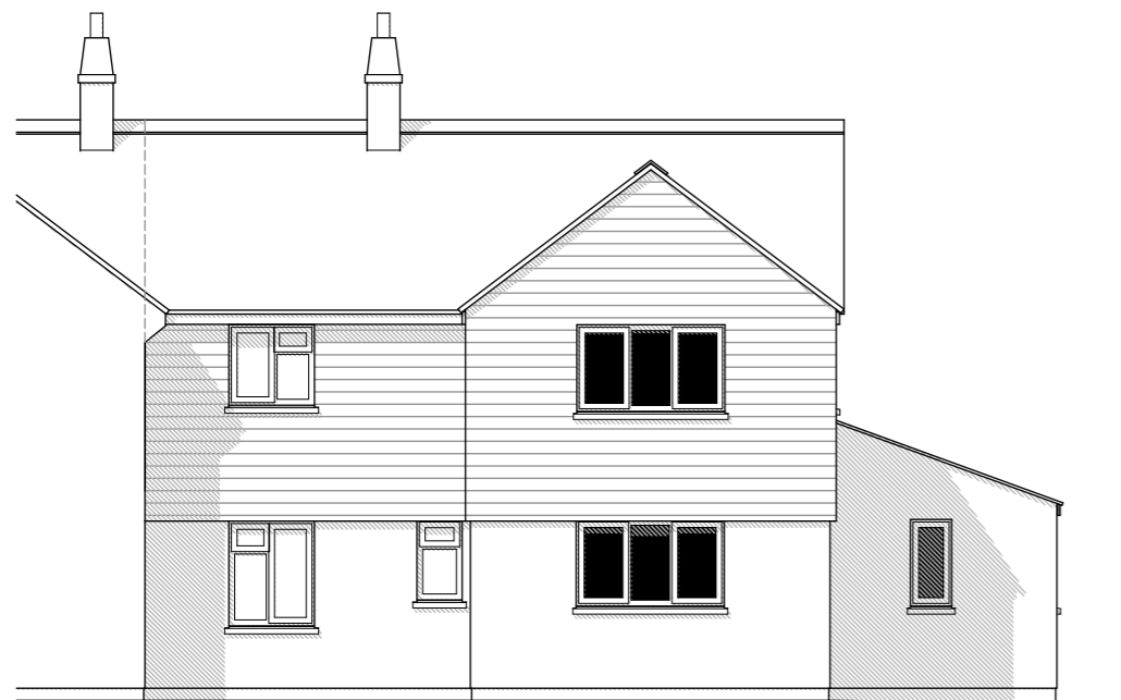
SE (FRONT) ELEVATION 1:100