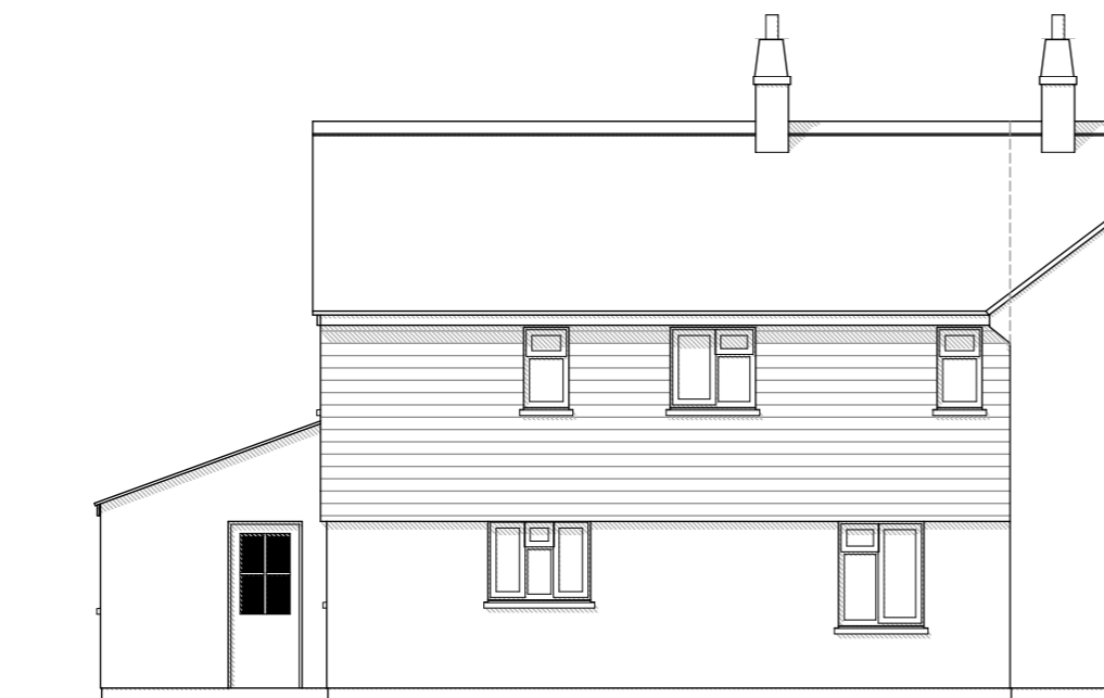
NW (REAR) ELEVATION 1:100