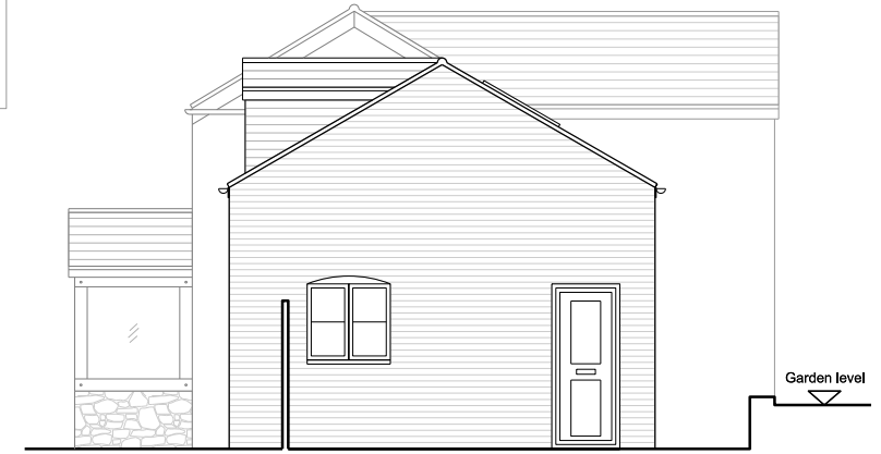
Proposed Side / North Elevation