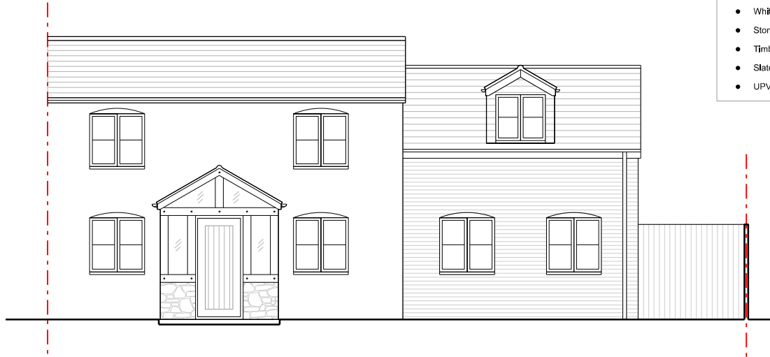
Proposed Front / East Elevation