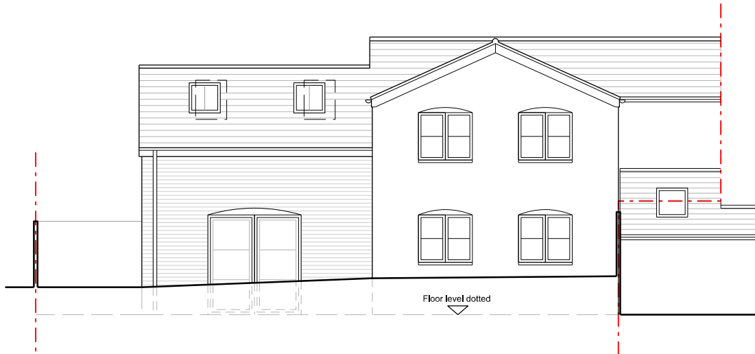
Proposed Rear / West Elevation