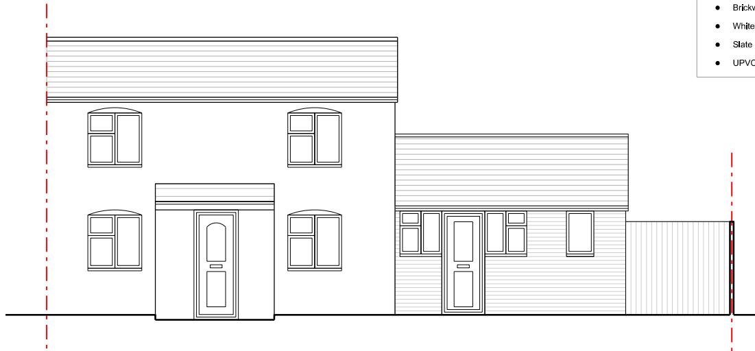
Existing Front / East Elevation