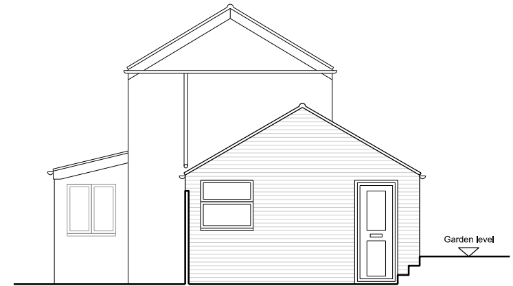
Existing Side / North Elevation