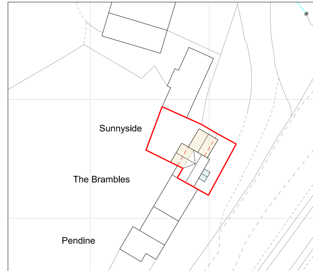
Proposed Block Plan