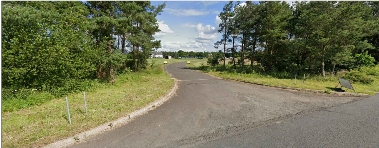
Existing Elevation @ NTS