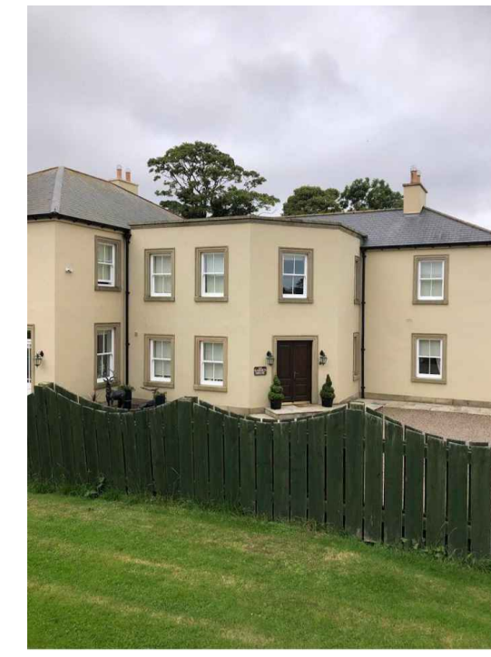
Image 05 - South East Elevation 1