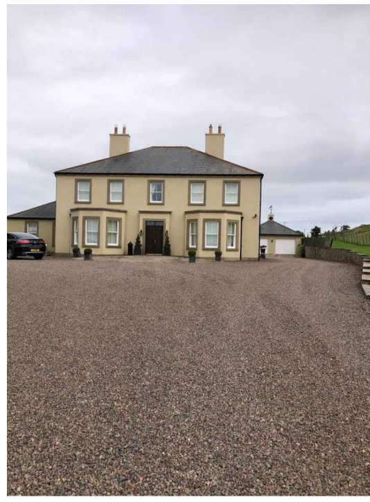
Image 01 - South Elevation 1