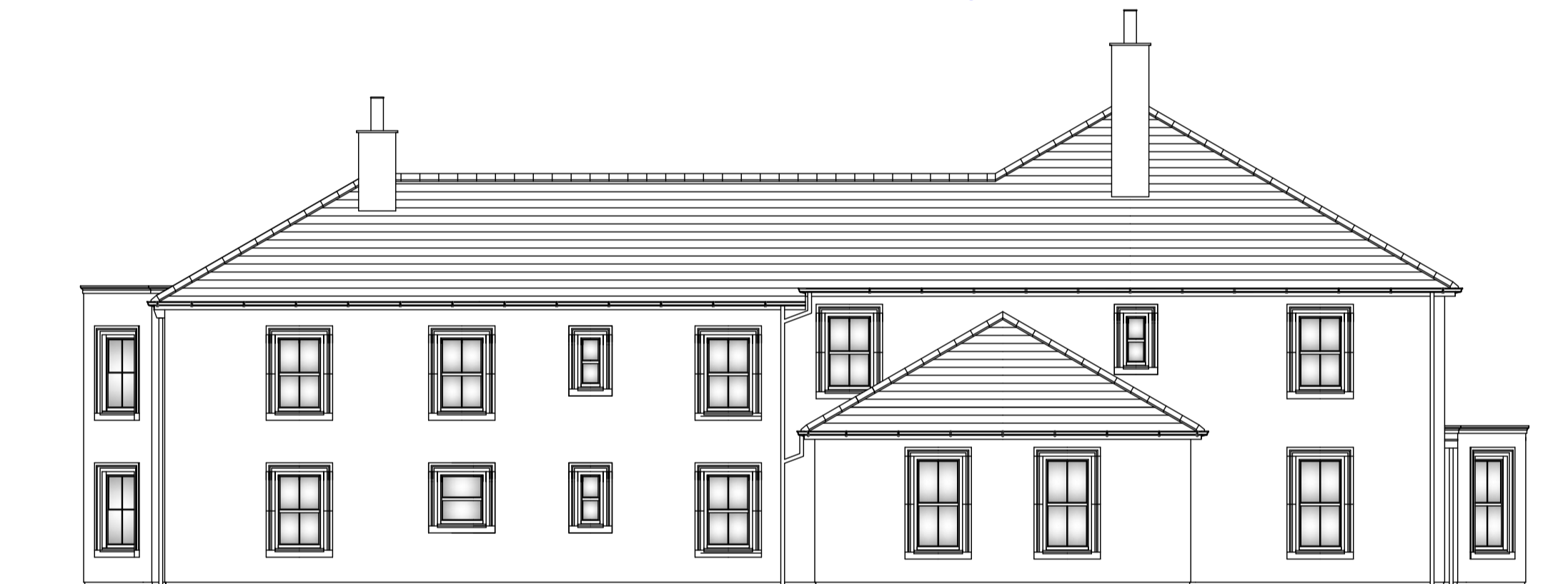
North West Elevation As Proposed (No Change)