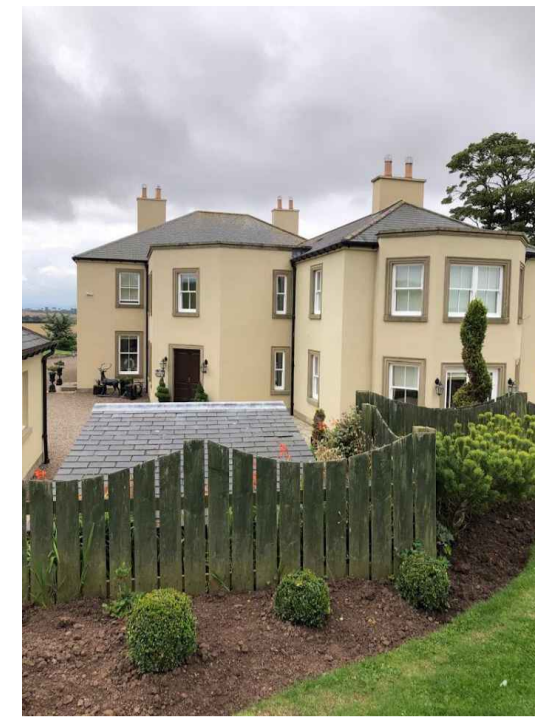
Image 04 - North East & South East Elevations