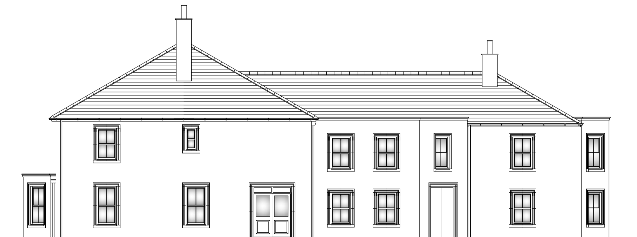
South East Elevation As Existing