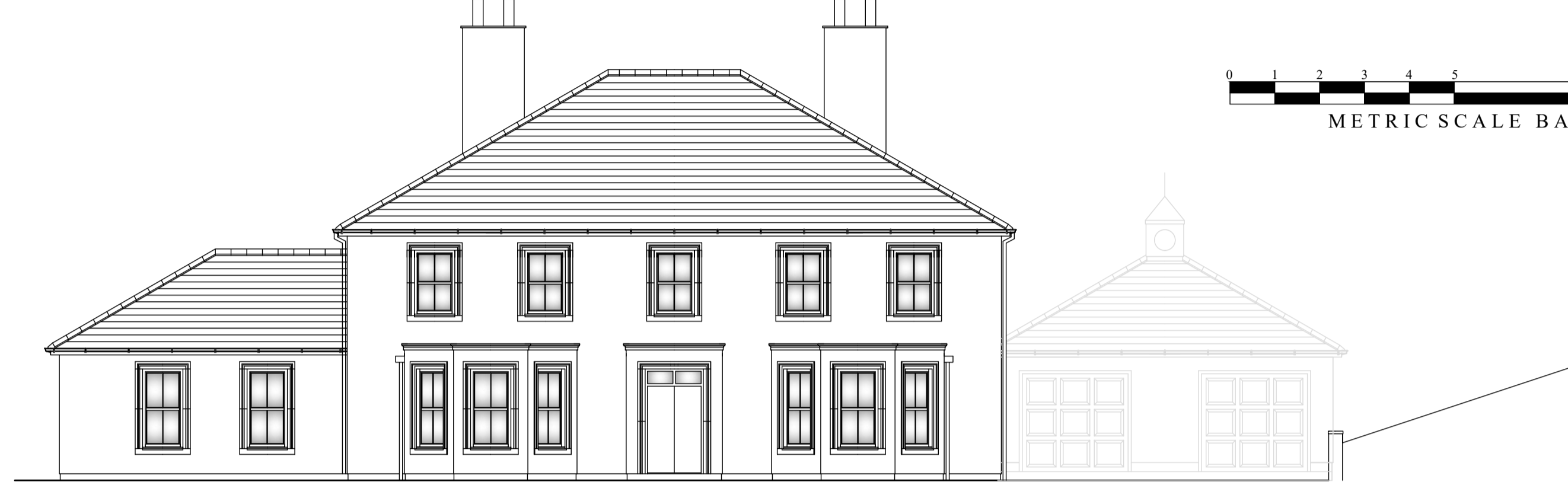
South West Elevation As Existing