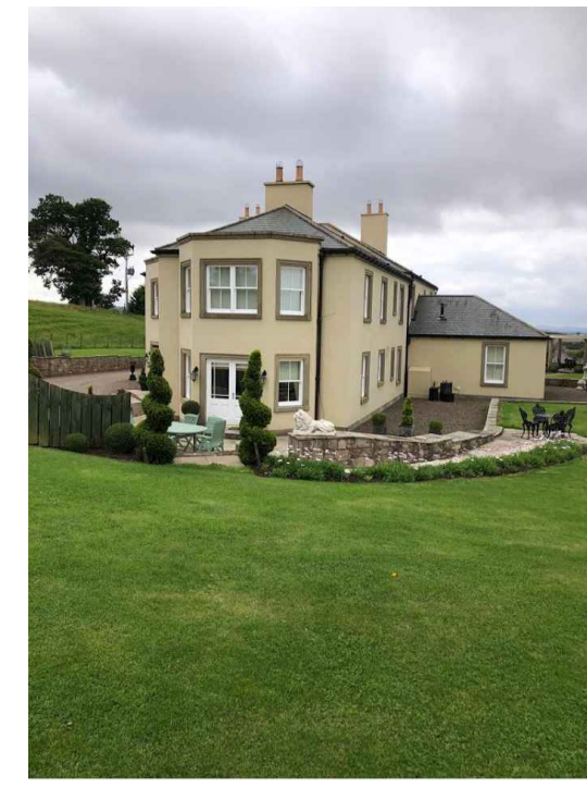
Image 03 - North West & North East Elevations