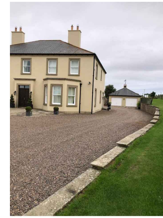
Image 07 - South Elevation 2