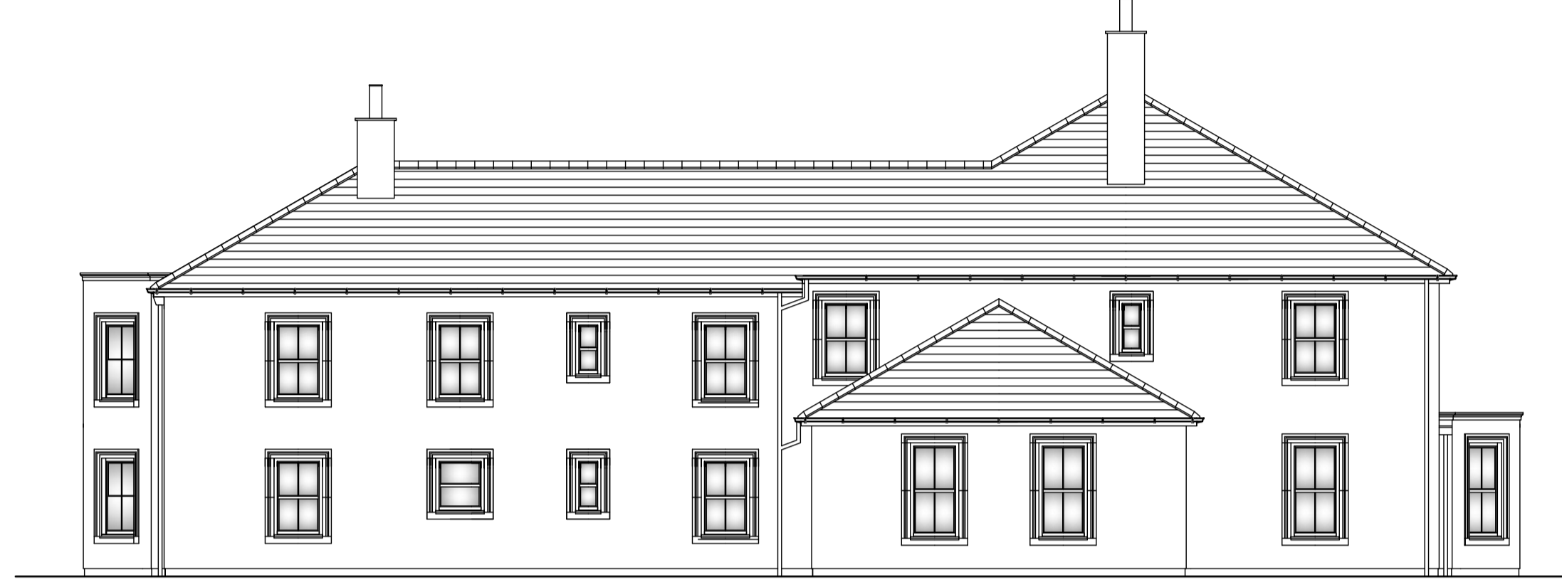
North West Elevation As Existing (No Change)