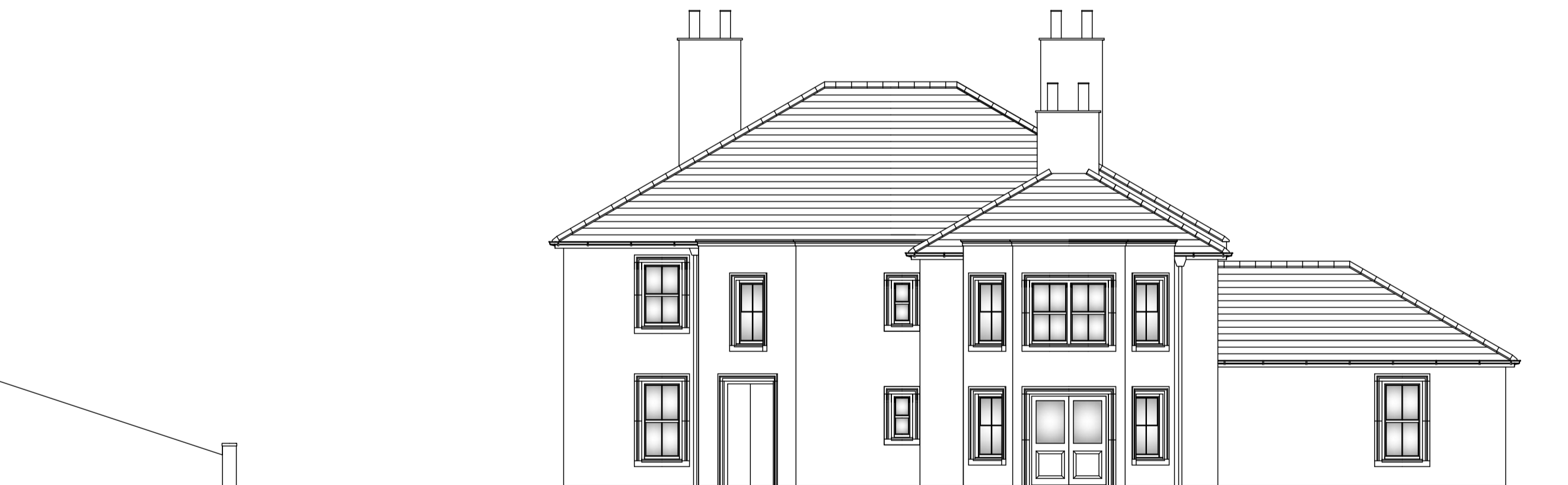
North East Elevation As Existing