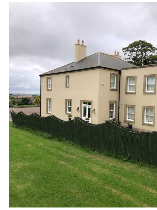
Image 06 - South East Elevation 2