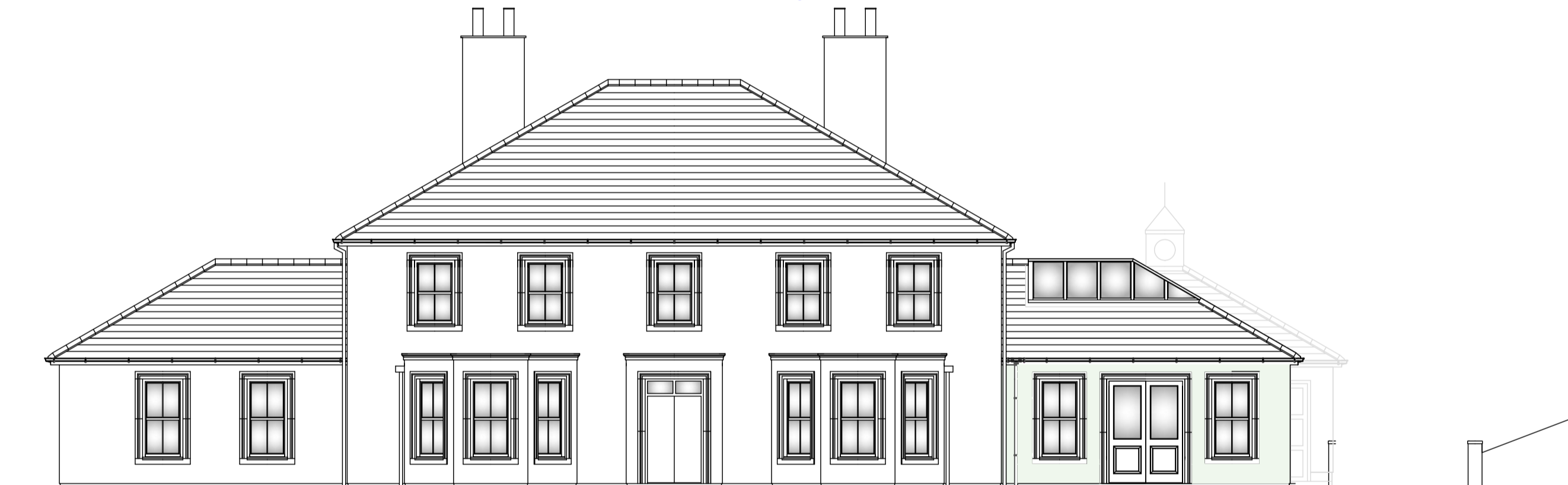
South West Elevation As Proposed