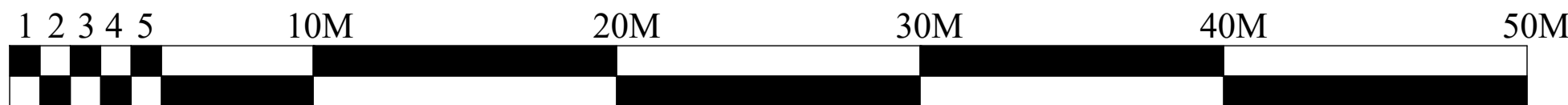
METRIC SCALE BAR

©YEOMAN ARCHITECTURE LIMITED Copyright of this plan is retained by YEOMAN ARCHITECTURE LIMITED No part should be copied or reproduced without the express permission of the copyright holder.