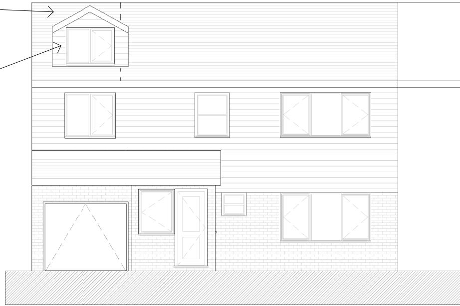
1 P- Front Elevation 1:100

Proposed roof tiles to match existing. Hanging roof tiles to dormer to match existing.