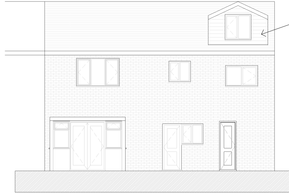
2 P- Rear Elevation 1:100

Hanging roof tiles to dormer to match existing.