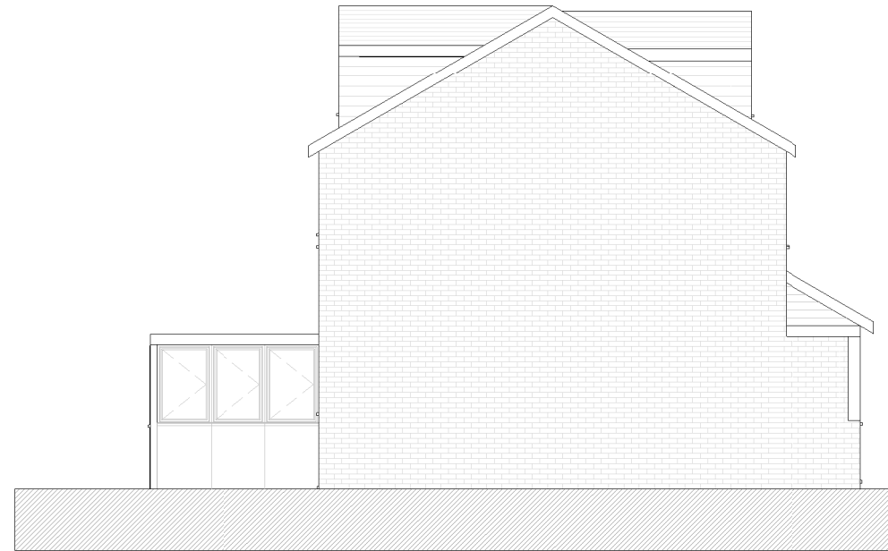
3 P- Side Elevation (West) 1:100