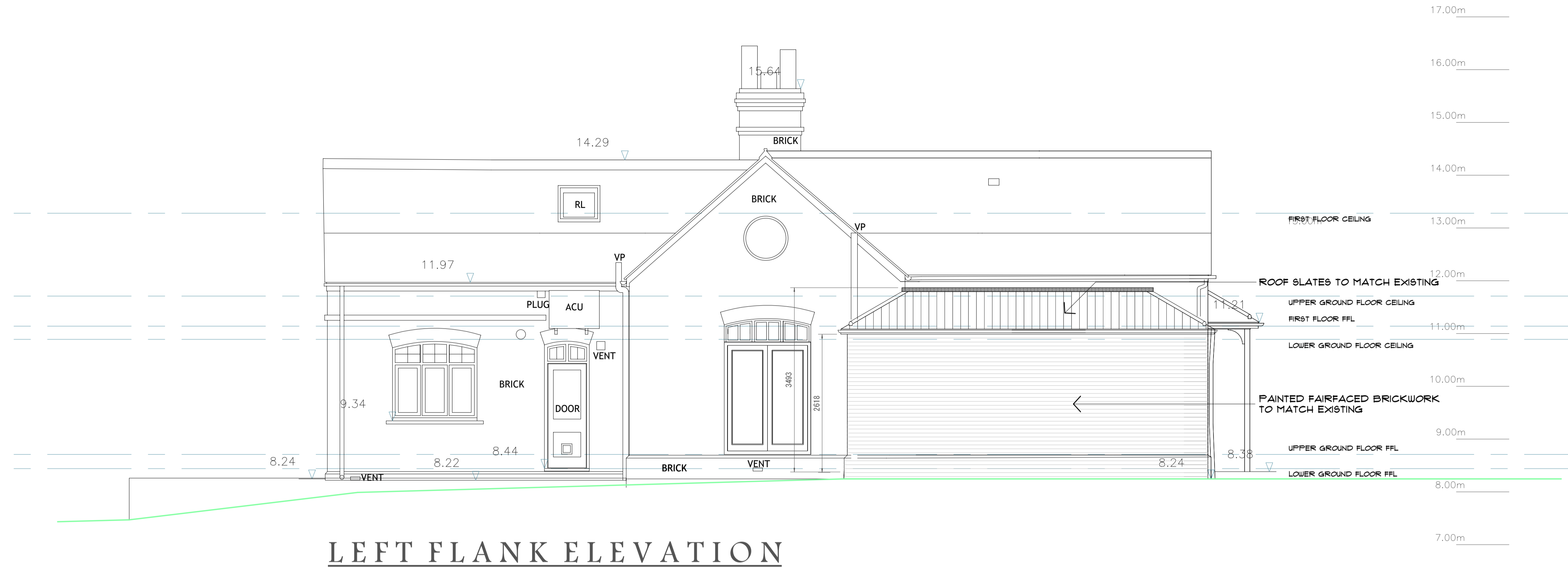
LEFT FLANK ELEVATION