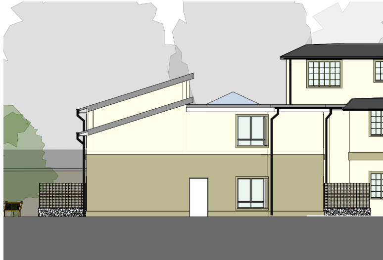
Approved application side elevation (Before)