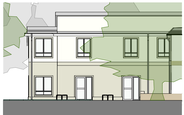
Non material amendment side elevation (Proposed)