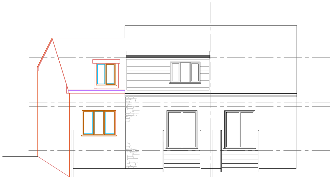
07 Proposed South East (Rear) Elevation SE scale 1:100

NOTES. THIS DRAWING IS COPYRIGHT. THE DRAWING IS NOT TO BE USED FOR CONSTRUCTION UNLESS MARKED 'FOR CONSTRUCTION' THE CONTRACTOR IS RESPONSIBLE FOR ALL DIMENSIONS AND THE CORRECT SETTING OUT ON SITE. ONLY FIGURED DIMENSIONS ARE TO BE USED, IF IN DOUBT ASK. ALL MATERIALS AND WORKMANSHIP TO COMPLY WITH THE CURRENT BRITISH STANDARDS AND CODES OF PRACTICE.