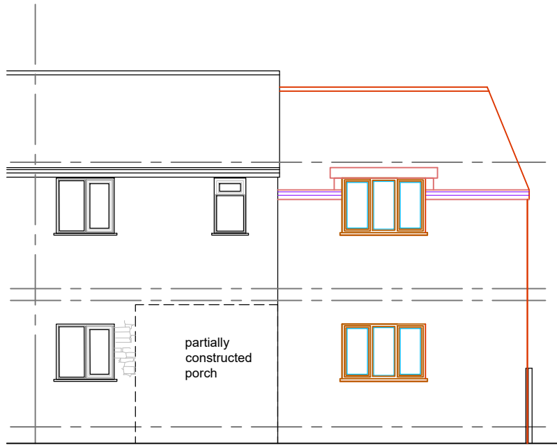
07 Proposed North West (Principal) Elevation NW scale 1:100