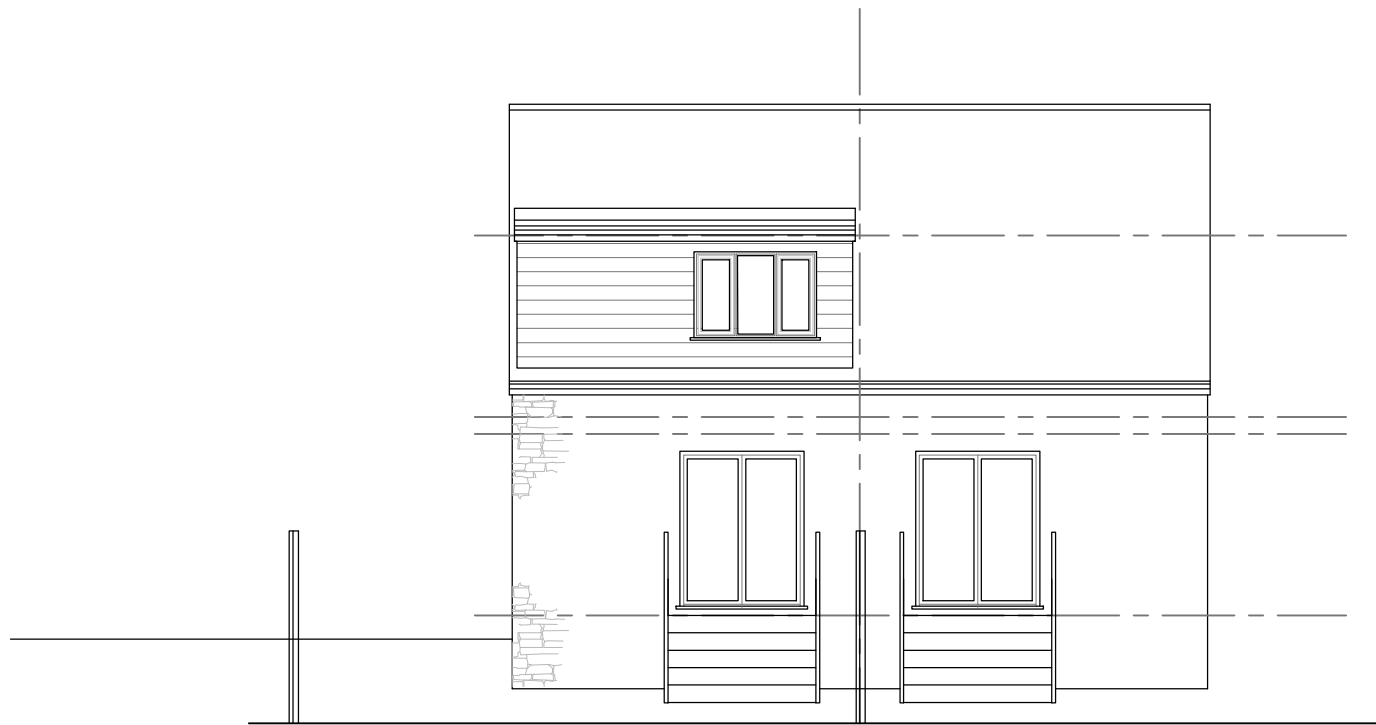
04 Existing South East (Rear) Elevation SE scale 1:100

NOTES. THIS DRAWING IS COPYRIGHT. THE DRAWING IS NOT TO BE USED FOR CONSTRUCTION UNLESS MARKED 'FOR CONSTRUCTION' THE CONTRACTOR IS RESPONSIBLE FOR ALL DIMENSIONS AND THE CORRECT SETTING OUT ON SITE. ONLY FIGURED DIMENSIONS ARE TO BE USED, IF IN DOUBT ASK. ALL MATERIALS AND WORKMANSHIP TO COMPLY WITH THE CURRENT BRITISH STANDARDS AND CODES OF PRACTICE.