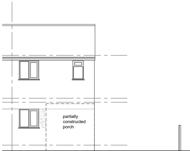
04 Existing North West (Principal) Elevation NW scale 1:100