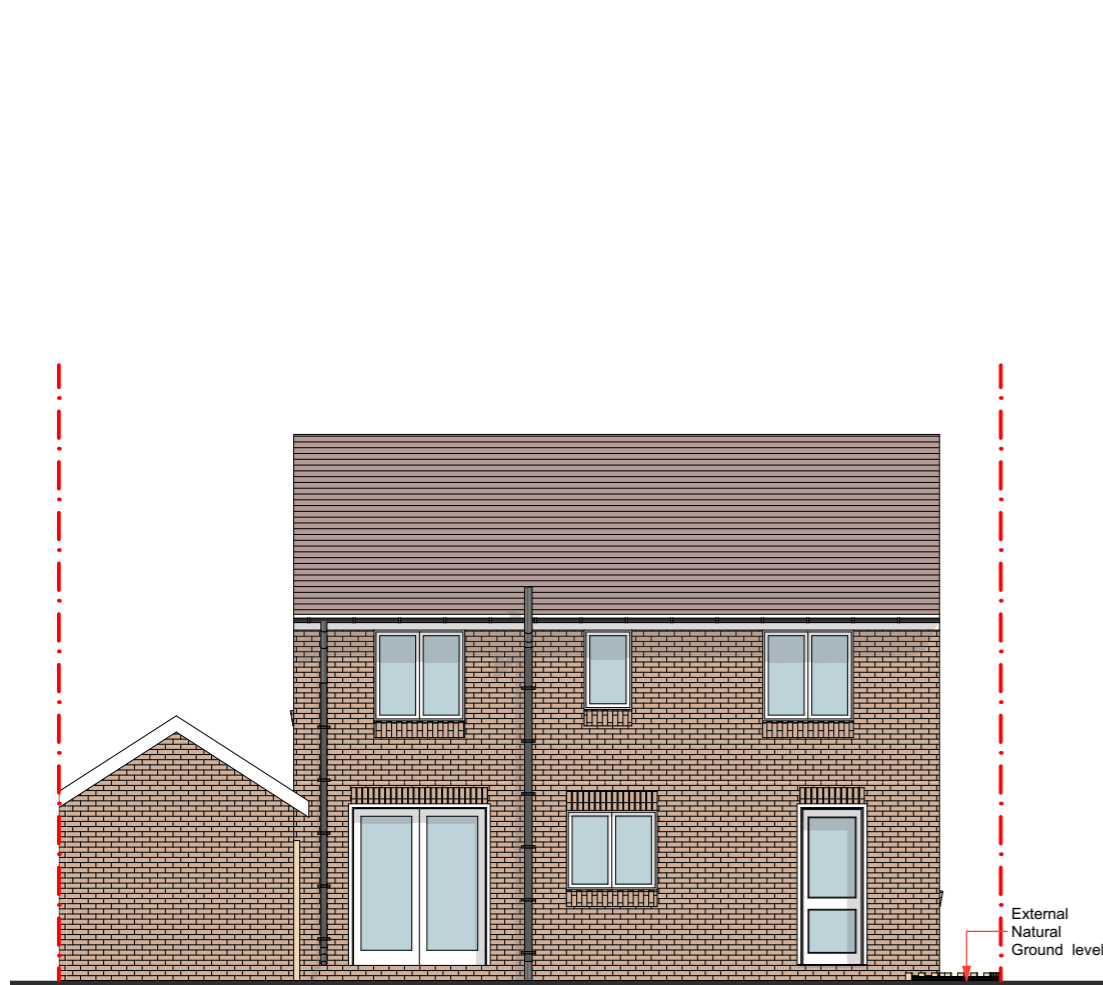
Proposed Rear Elevation 1:100

Any Side Window to be obscure glazing and, non openable below 1.7m