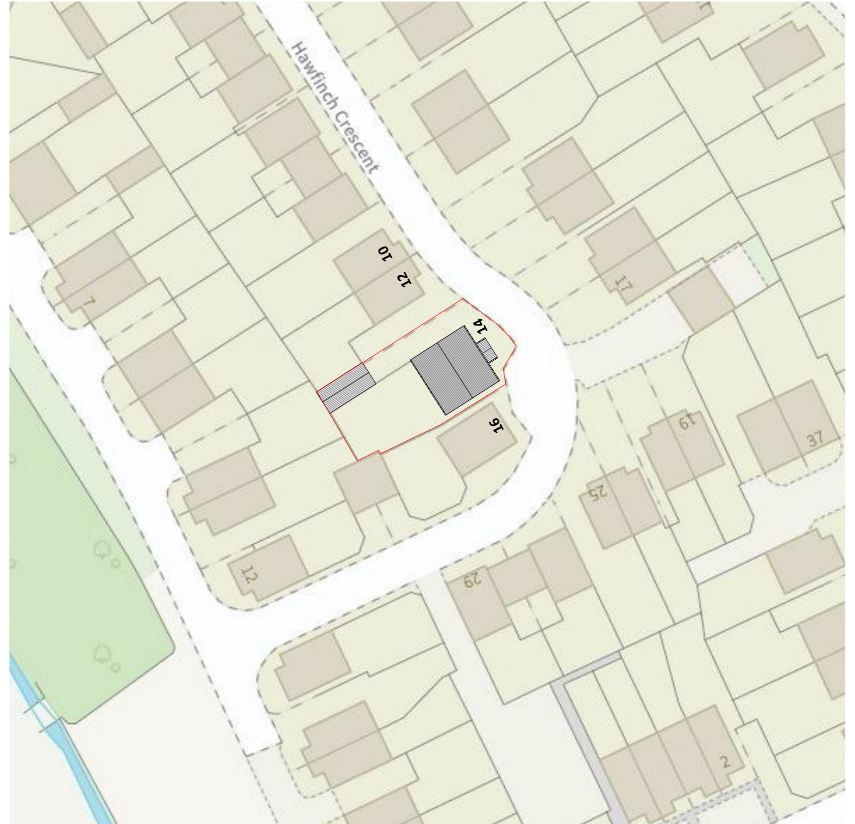
BLOCK PLAN scale 1:500

COPYRIGHT: The contents of this drawing may not be reproduced in whole or in part without express written consent of ARKSS Design Limited.