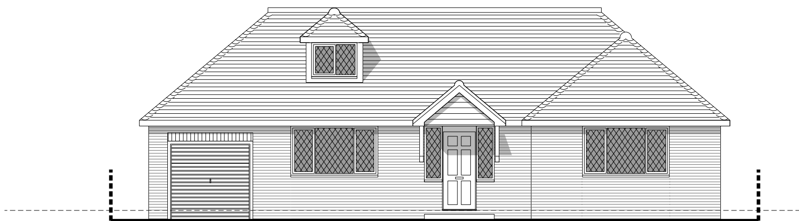
South (front) Elevation