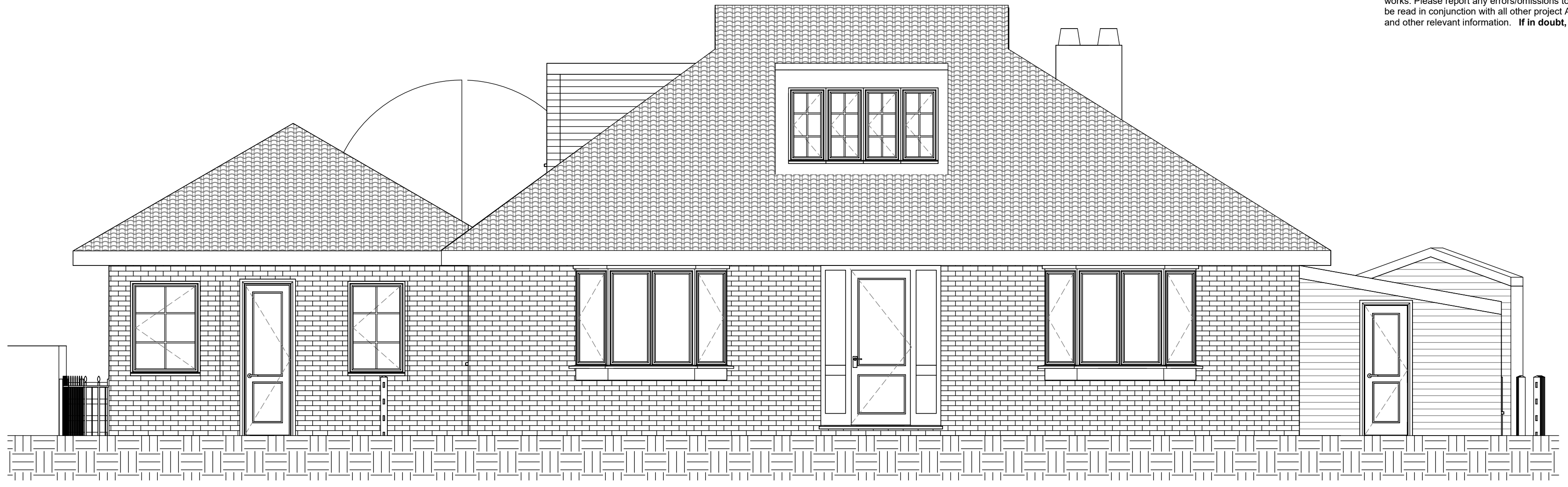
South West 1 : 50