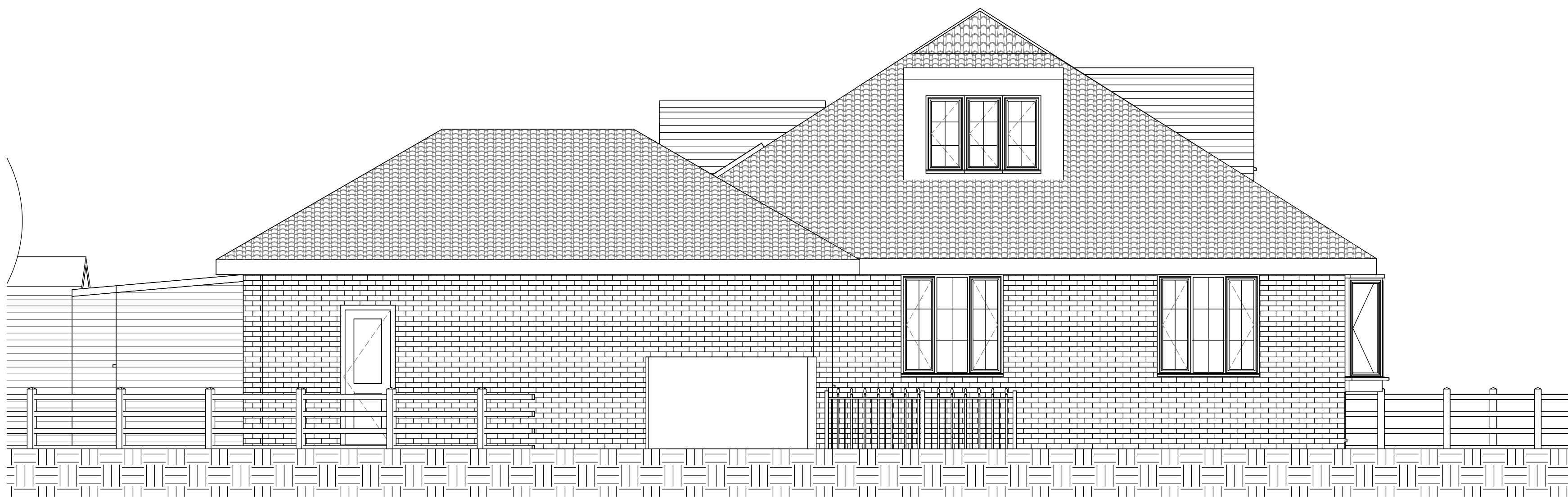
North West 1 : 50