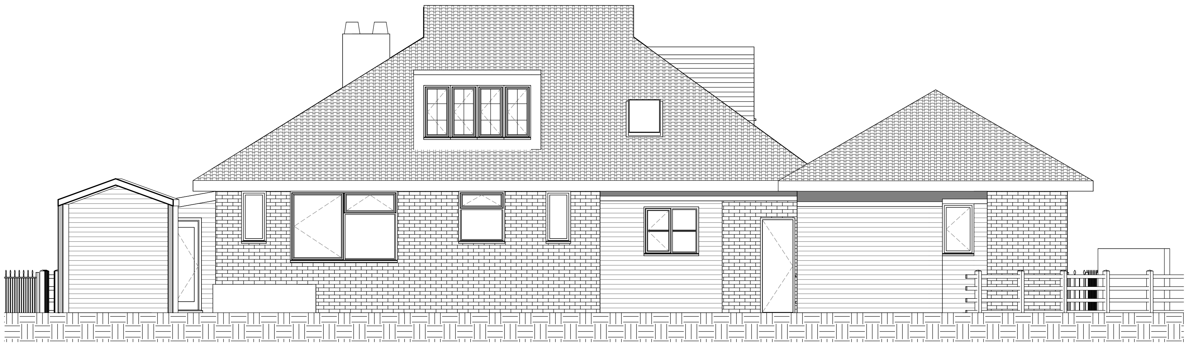
North East 1 : 50