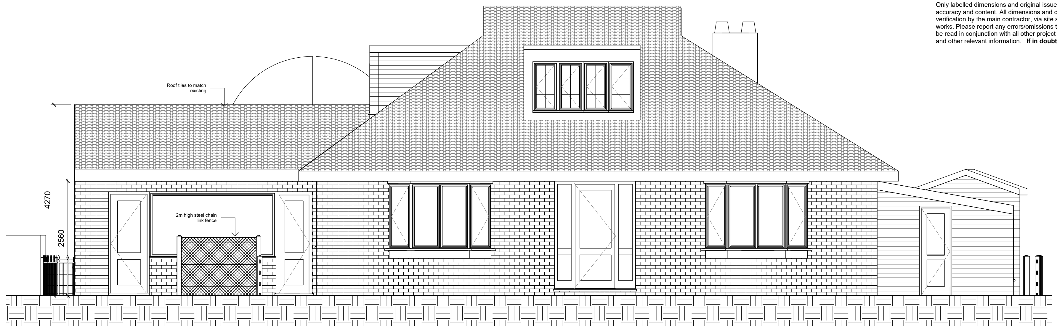
South West Proposed 1 : 50