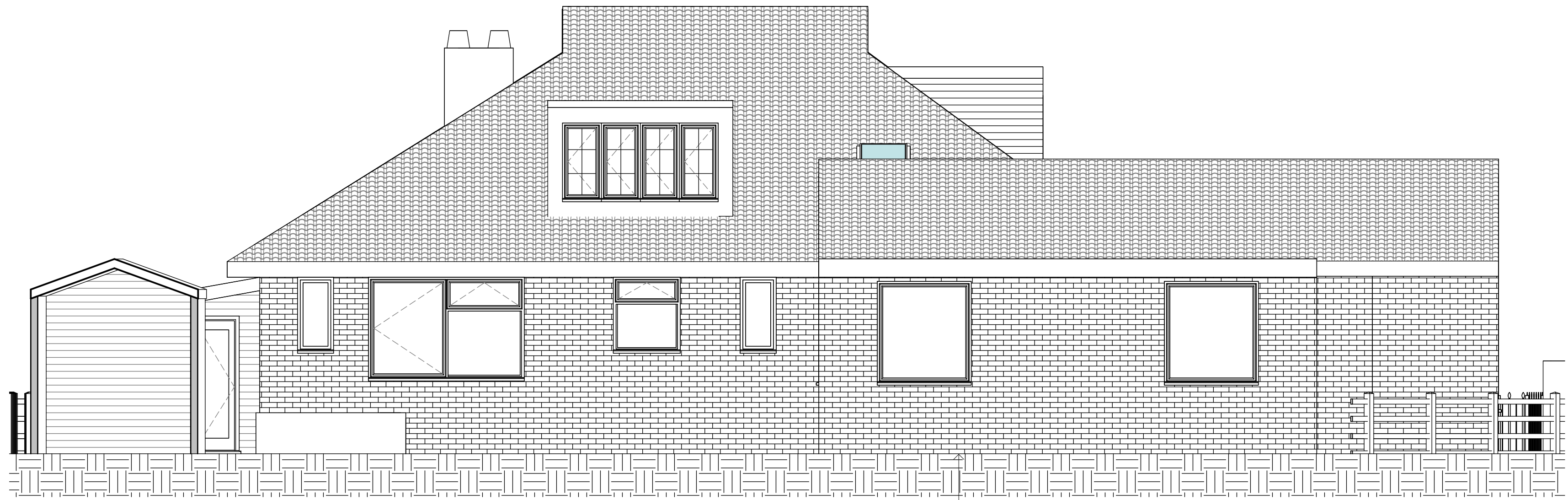
North East Proposed 1 : 50