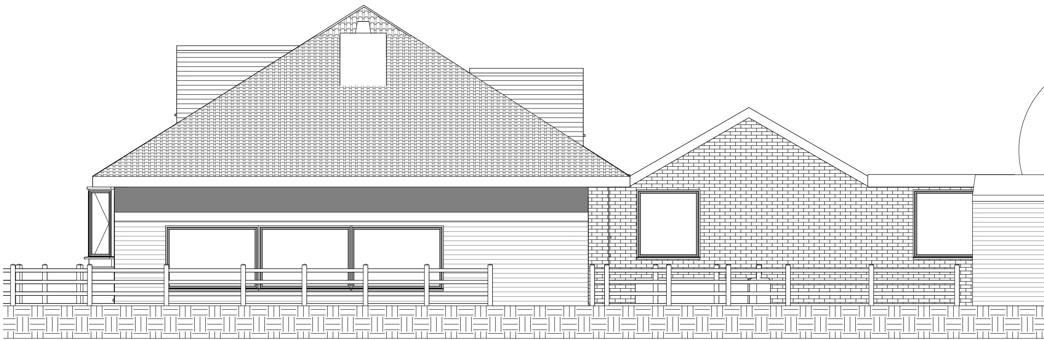
South East Proposed 1 : 50