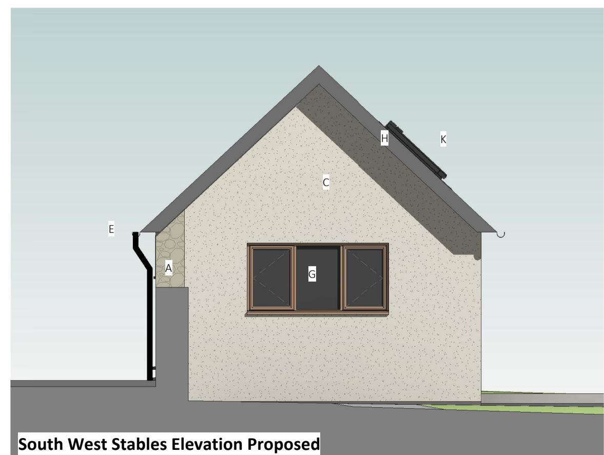
South West Stables Elevation Proposed