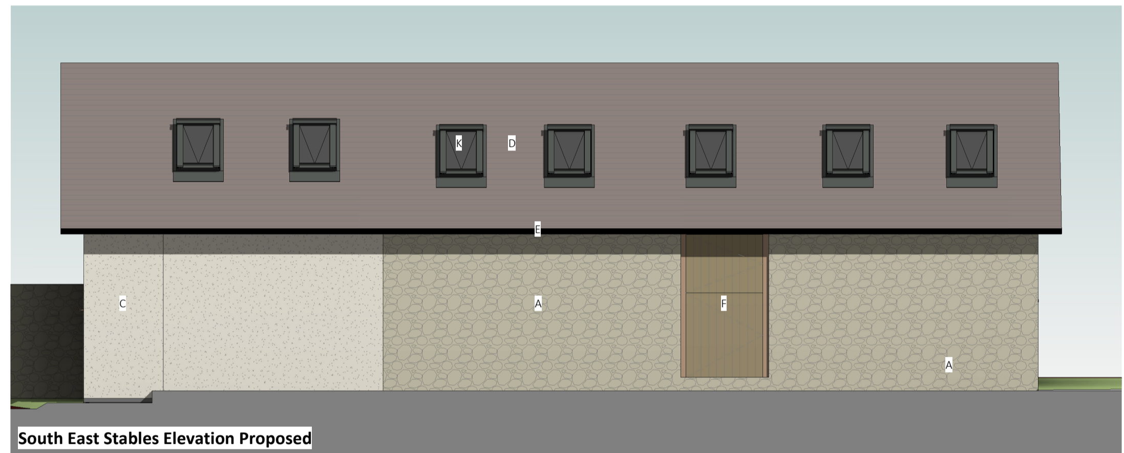
South East Stables Elevation Proposed