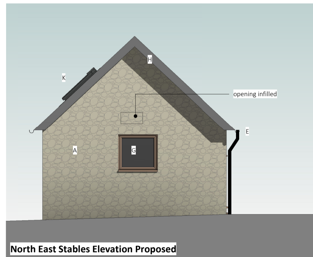
North East Stables Elevation Proposed