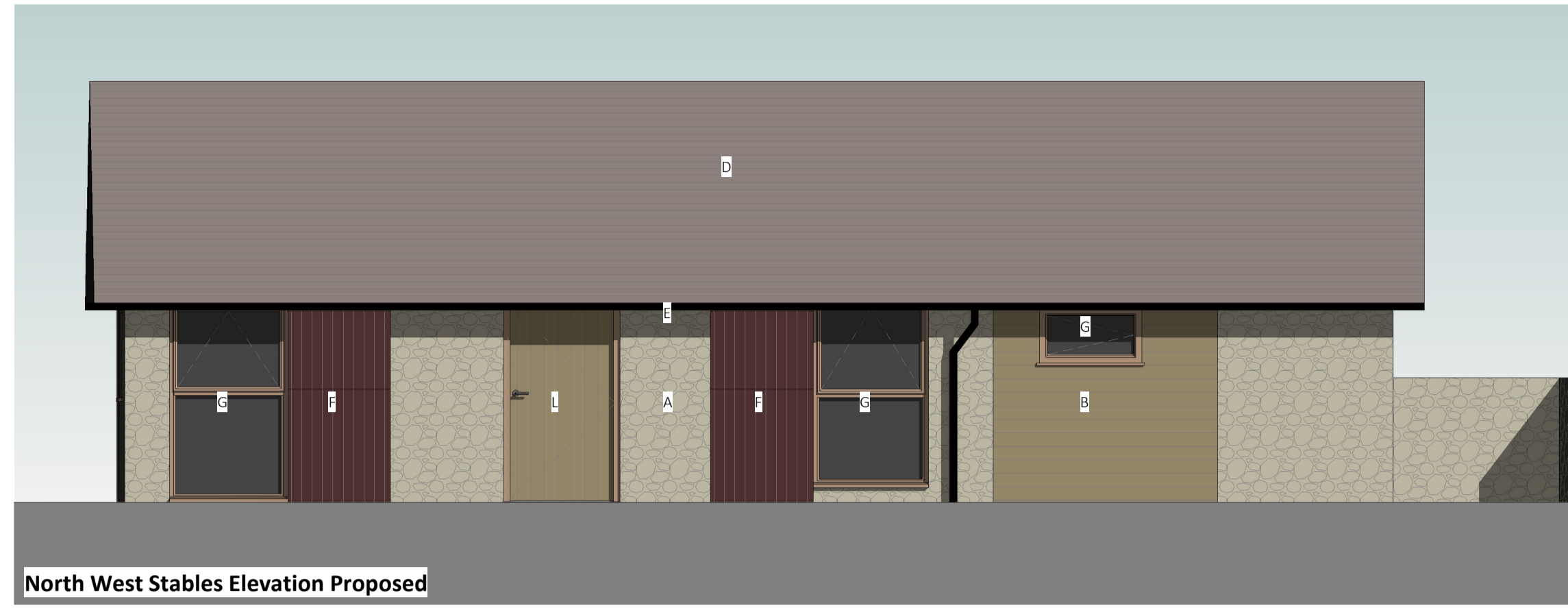
North West Stables Elevation Proposed