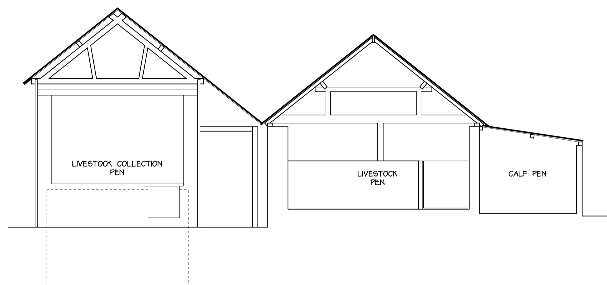
TYPICAL SECTION A - A 1 / 50