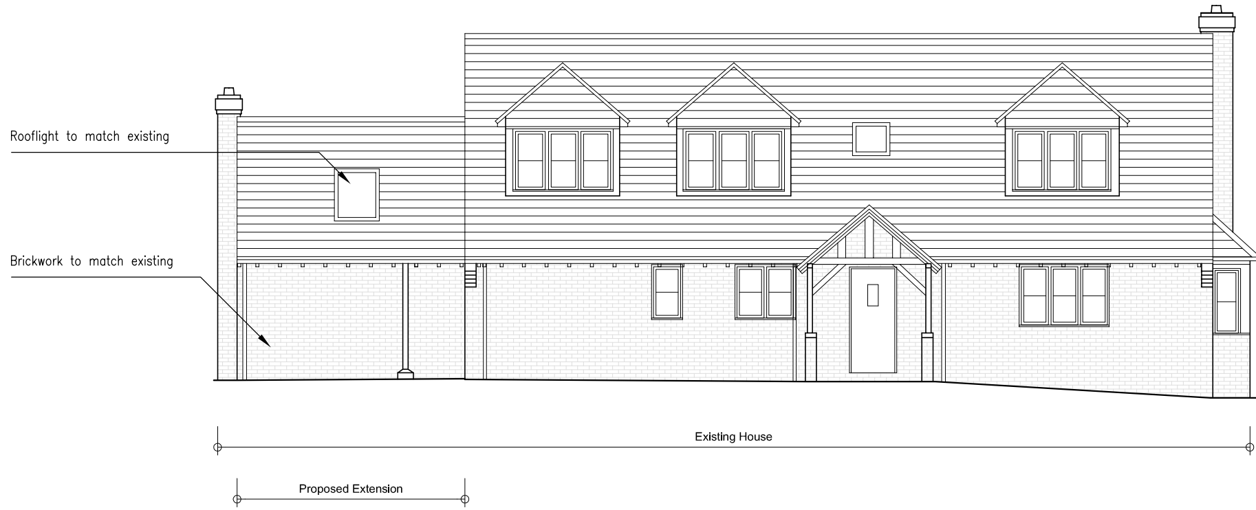
01 PROPOSED EAST ELEVATION 1:100