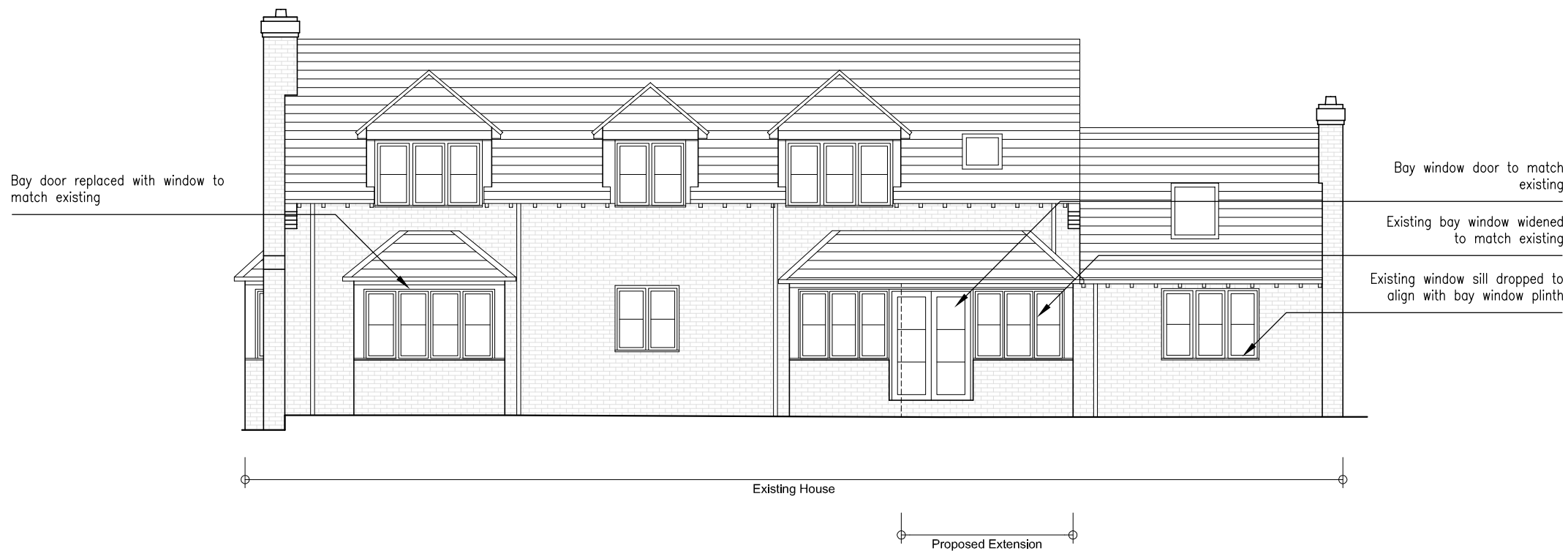
02 PROPOSED WEST ELEVATION 1:100