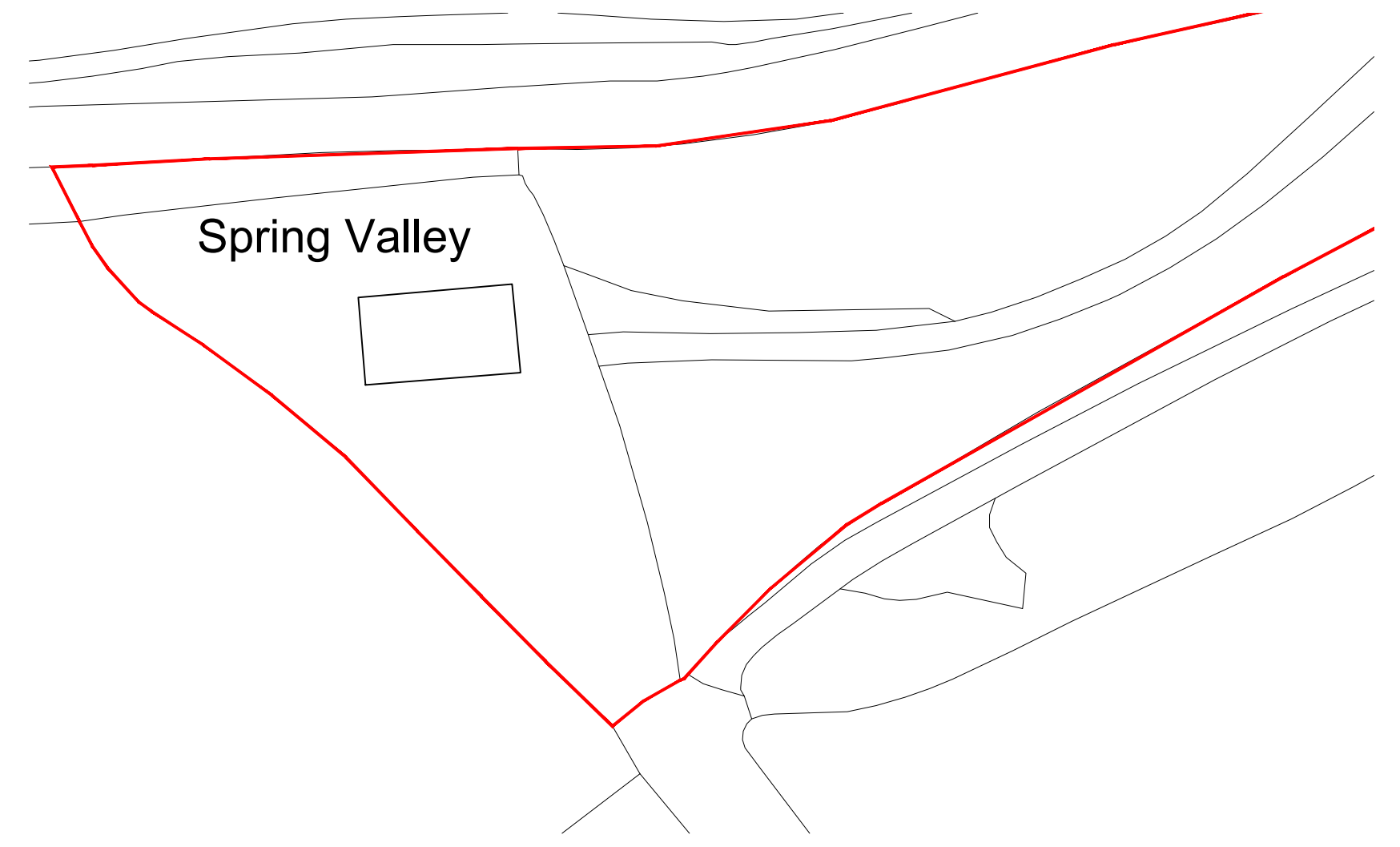
SITE BLOCK PLAN