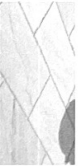
BRADSTONE NATURAL SANDSTONE SILVER GREY PAVING