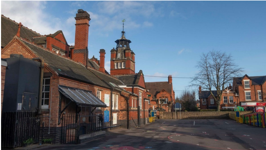
View of listed building from play ground showing the varying additions, obscured by the mobile from the road.

the bell tower and frontage (hence listing of part of the wall), the side of the building which has the mobile in front of it is a mixture of styles and extensions much of it not part of the original building, including a flat roof extension and oil tank. The mobile whilst a plain building of a different caricature does at least obscure some of these areas from the main road. The mobile is removable.