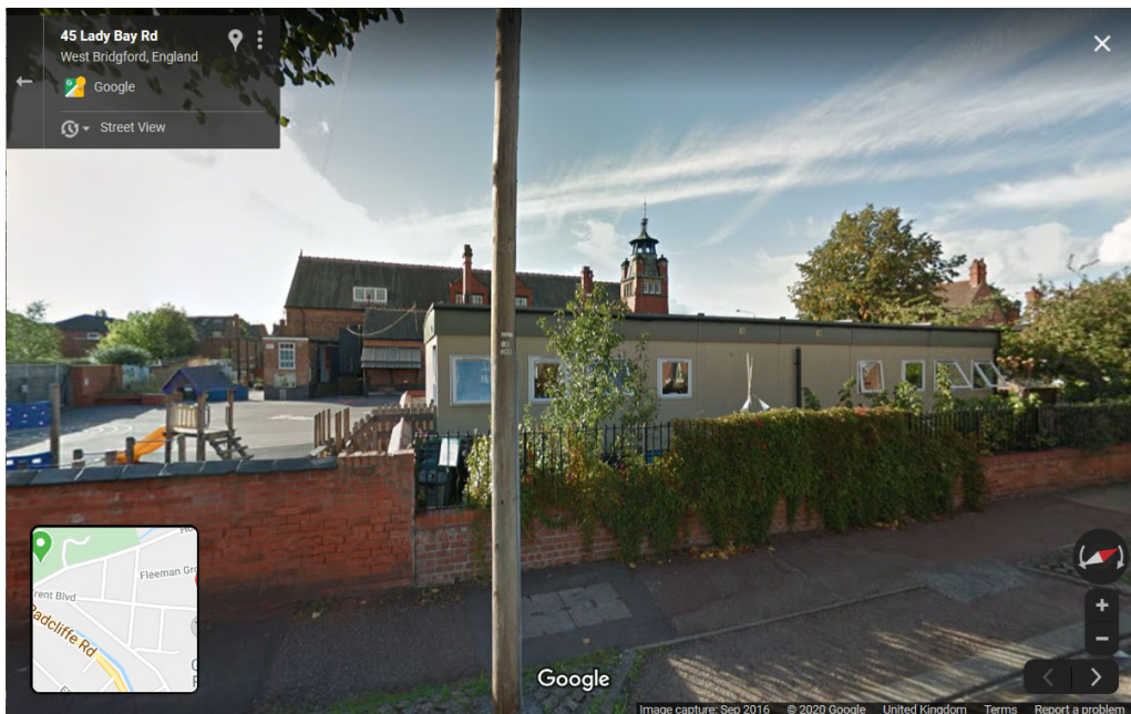
The view from lady Bay Road