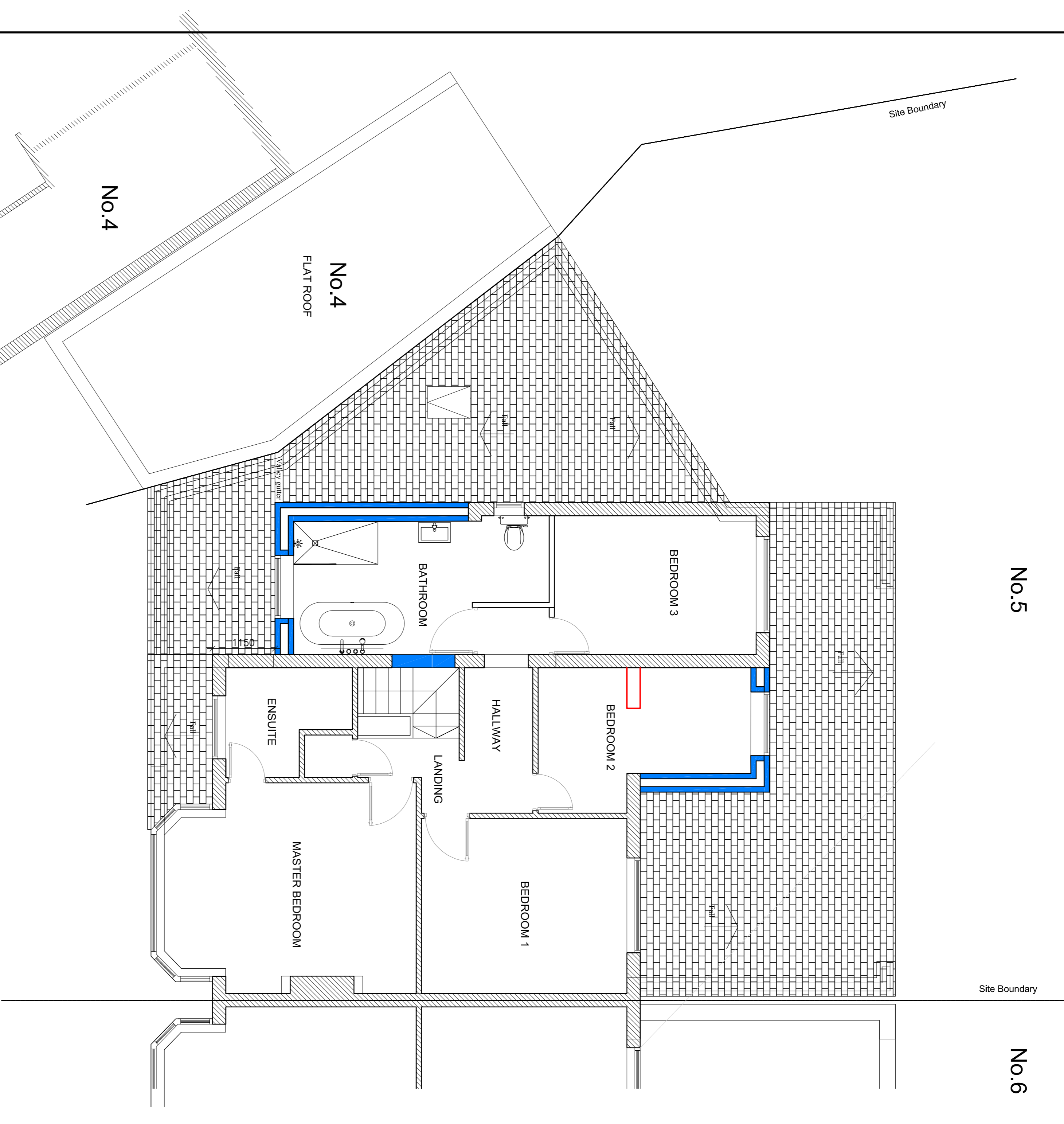
PROPOSED FIRST FLOOR LAYOUT