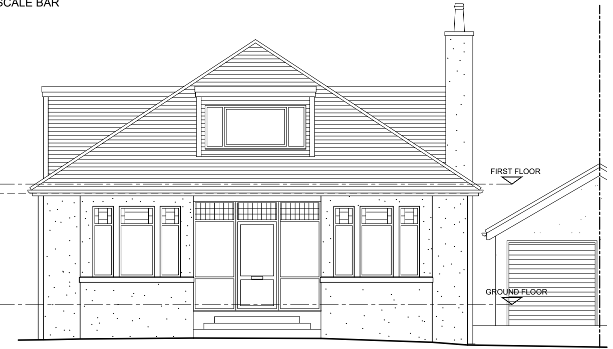
FRONT (WEST) ELEVATION

Do not scale the drawing. Use figured dimensions in all cases. Check all dimensions on site. Report any discrepancies in writing to Macdonald Dickson Architecture before proceeding.