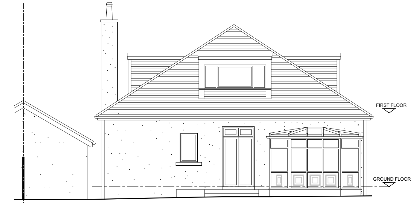
REAR (EAST) ELEVATION