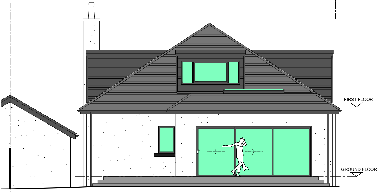
REAR (EAST) ELEVATION