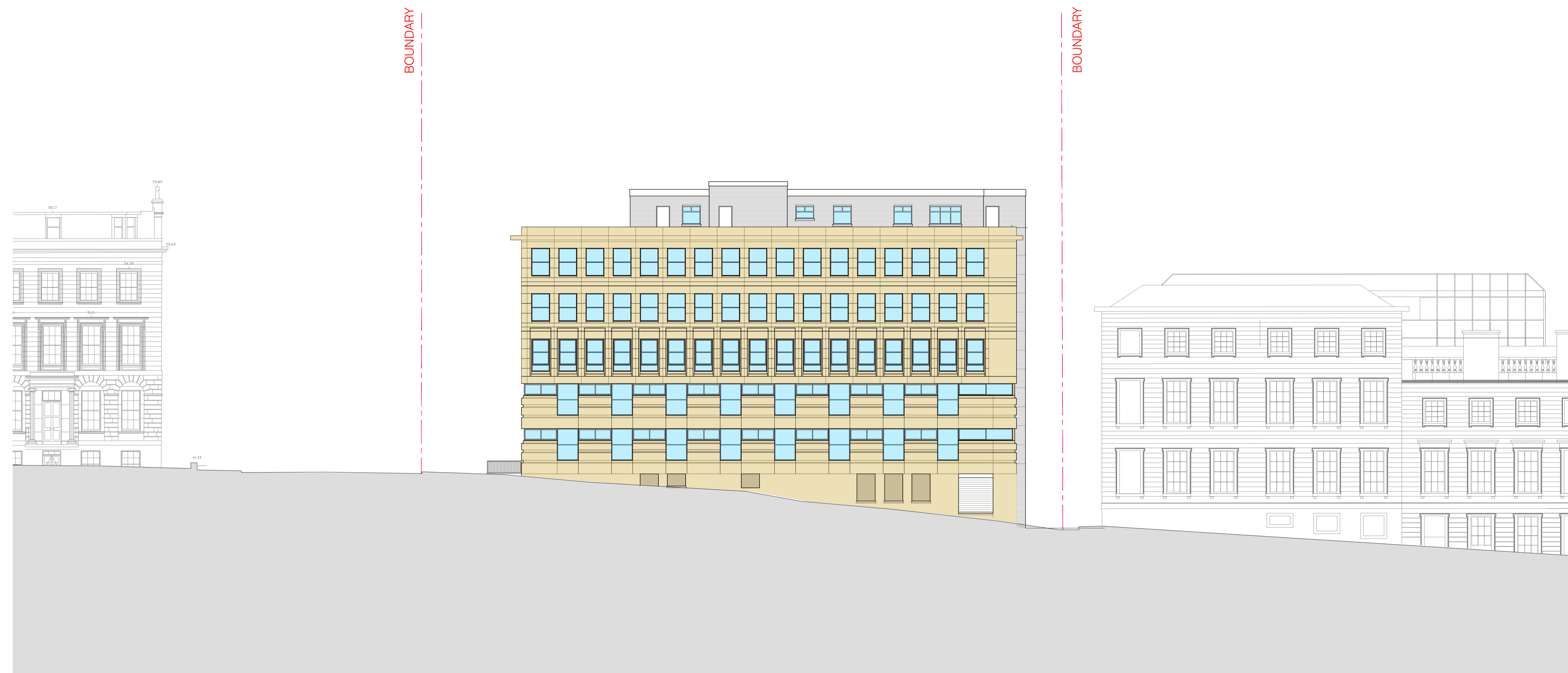
WEST ELEVATION - AS EXISTING

Status Rev Description Author Check Date REVISIONS