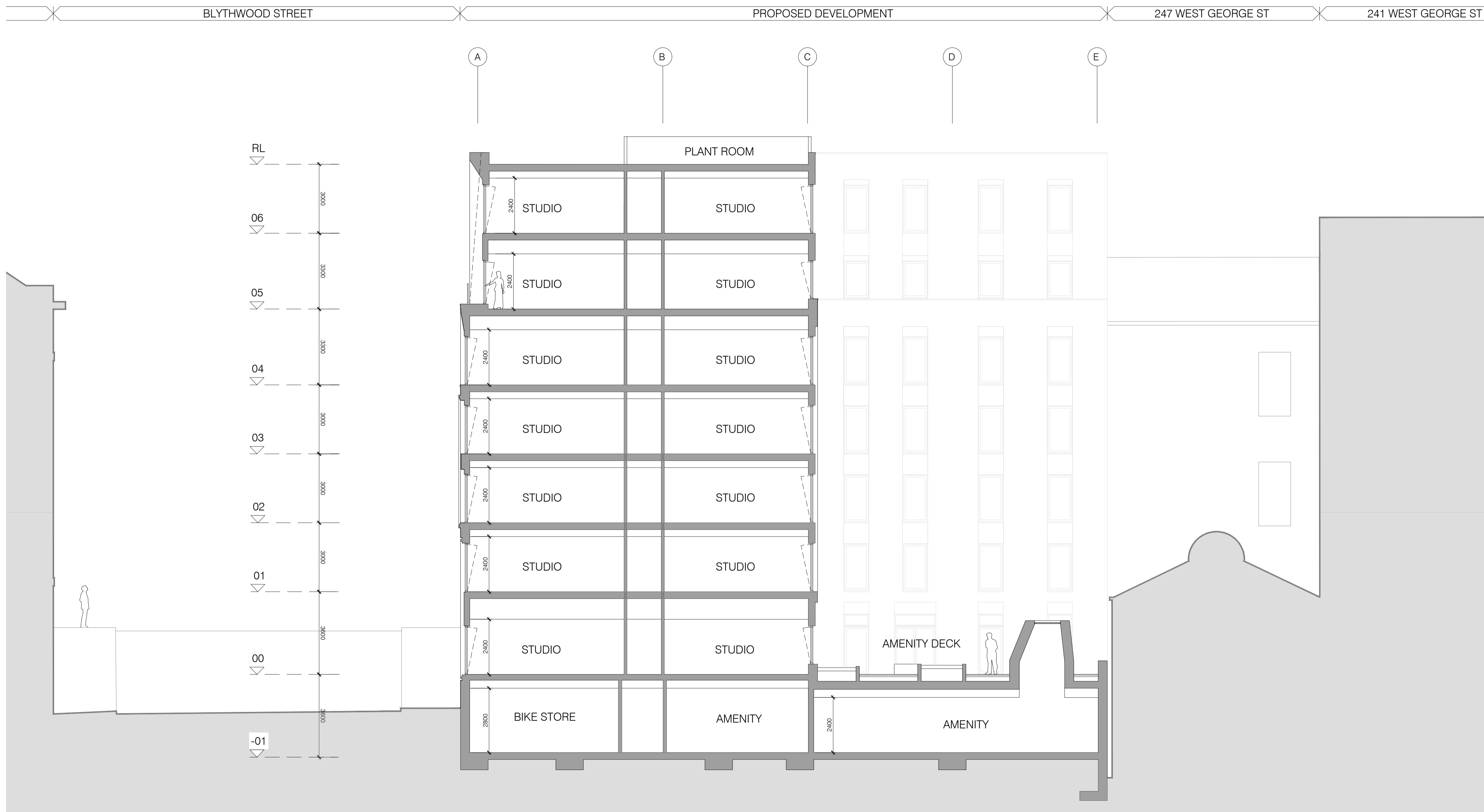
SECTION BB - AS PROPOSED