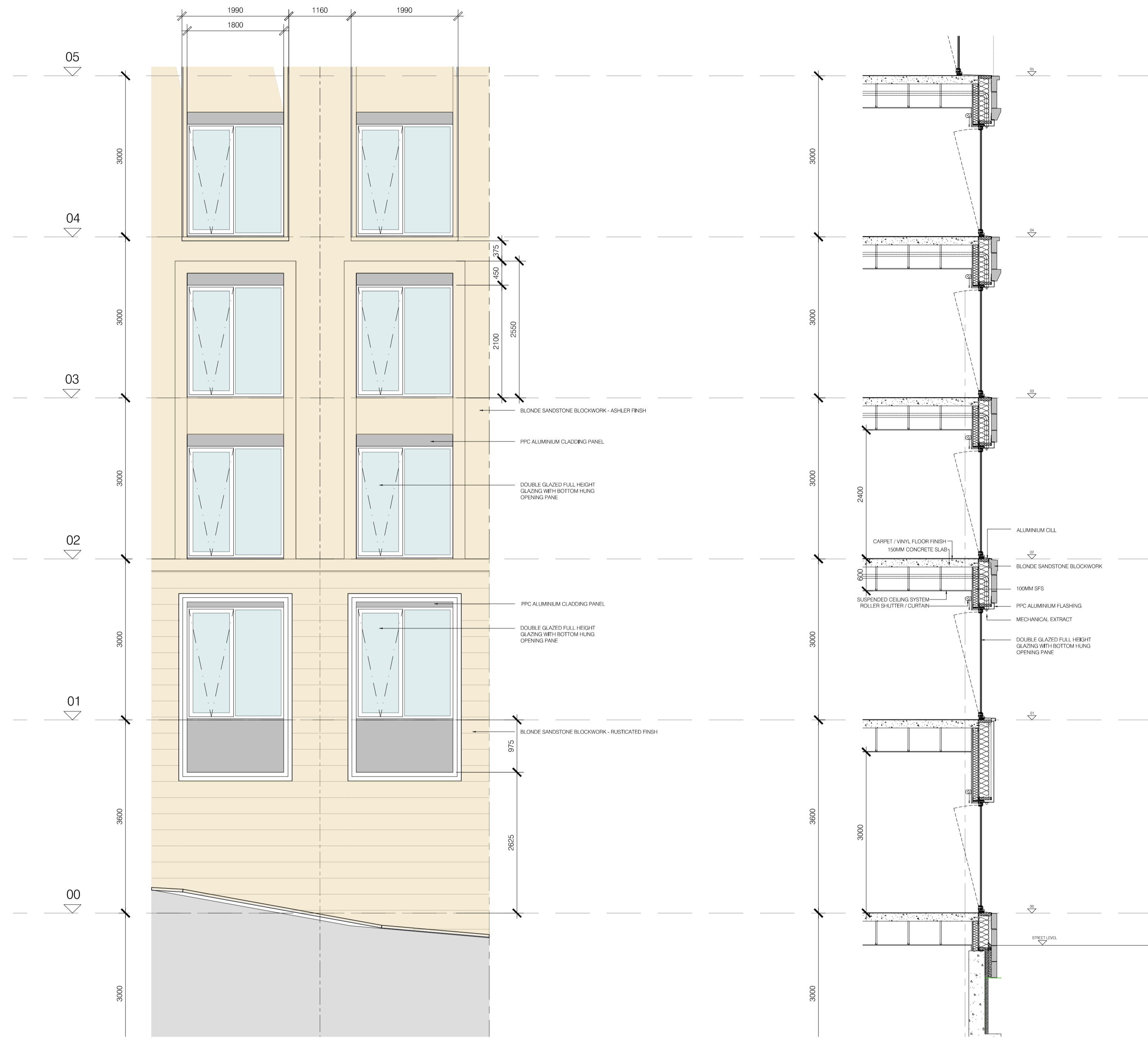
ELEVATION - SANDSTONE 1:50

Please do not scale from this drawing. All dimensions should be checked on site prior to commencing construction work. If in doubt please ask.