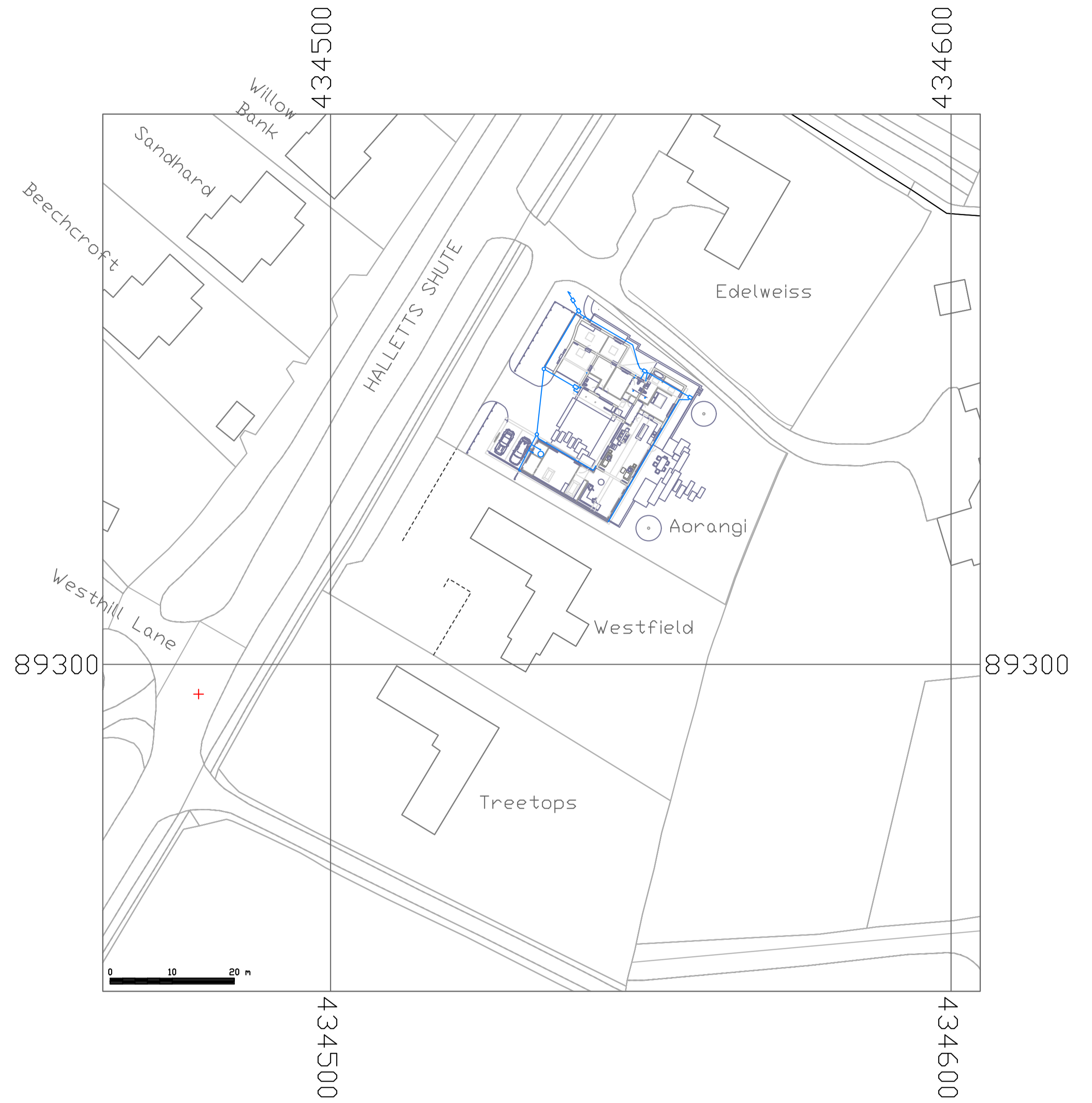
PROPOSED SITE PLAN -1:500 scale @ A1

MATERIALS KEY - 1-RENDER 2-STANDING SEAM METAL 3-STONE