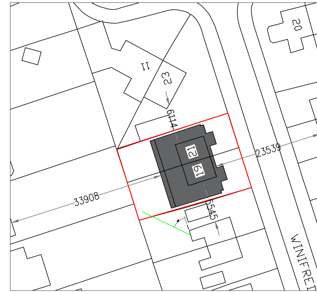
BLOCK PLAN (1:500)