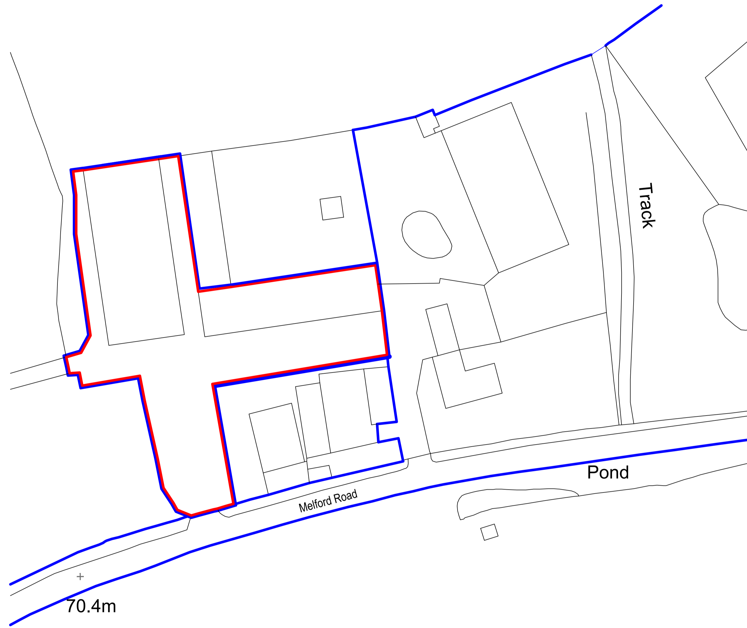
Block Plan 1.500