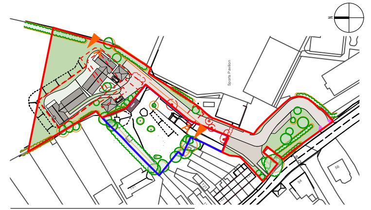
00 - Key Plan 1:2000@A3