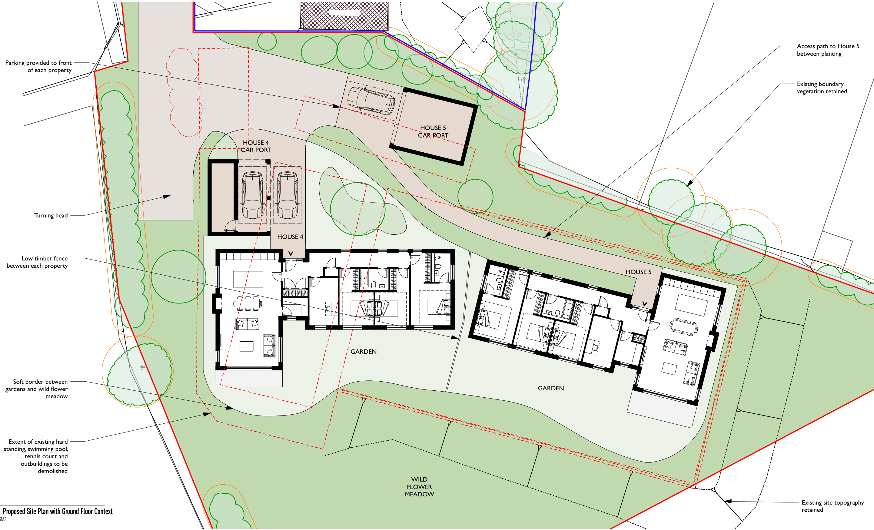
00 - Proposed Site Plan with Ground Floor Context 1:200@A3