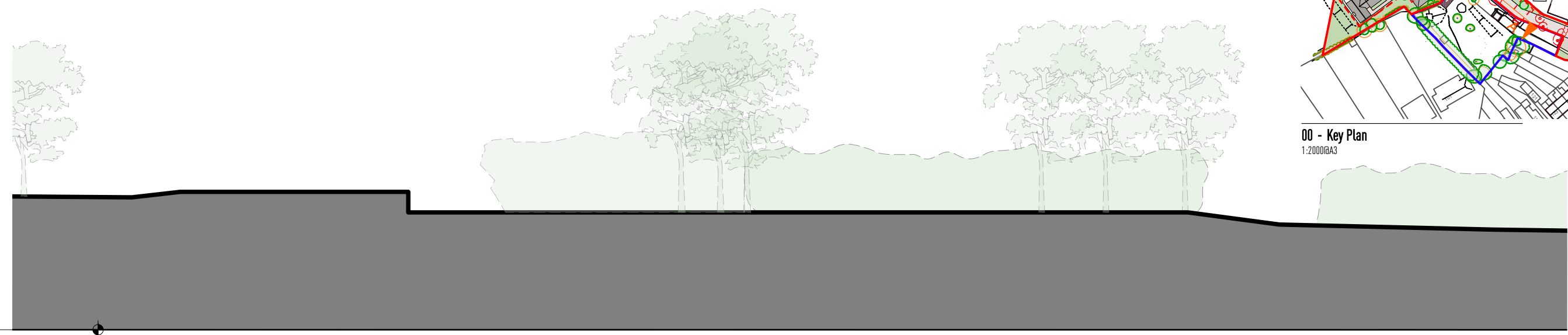
01 - Existing Site Section F-F 1:2000@A3