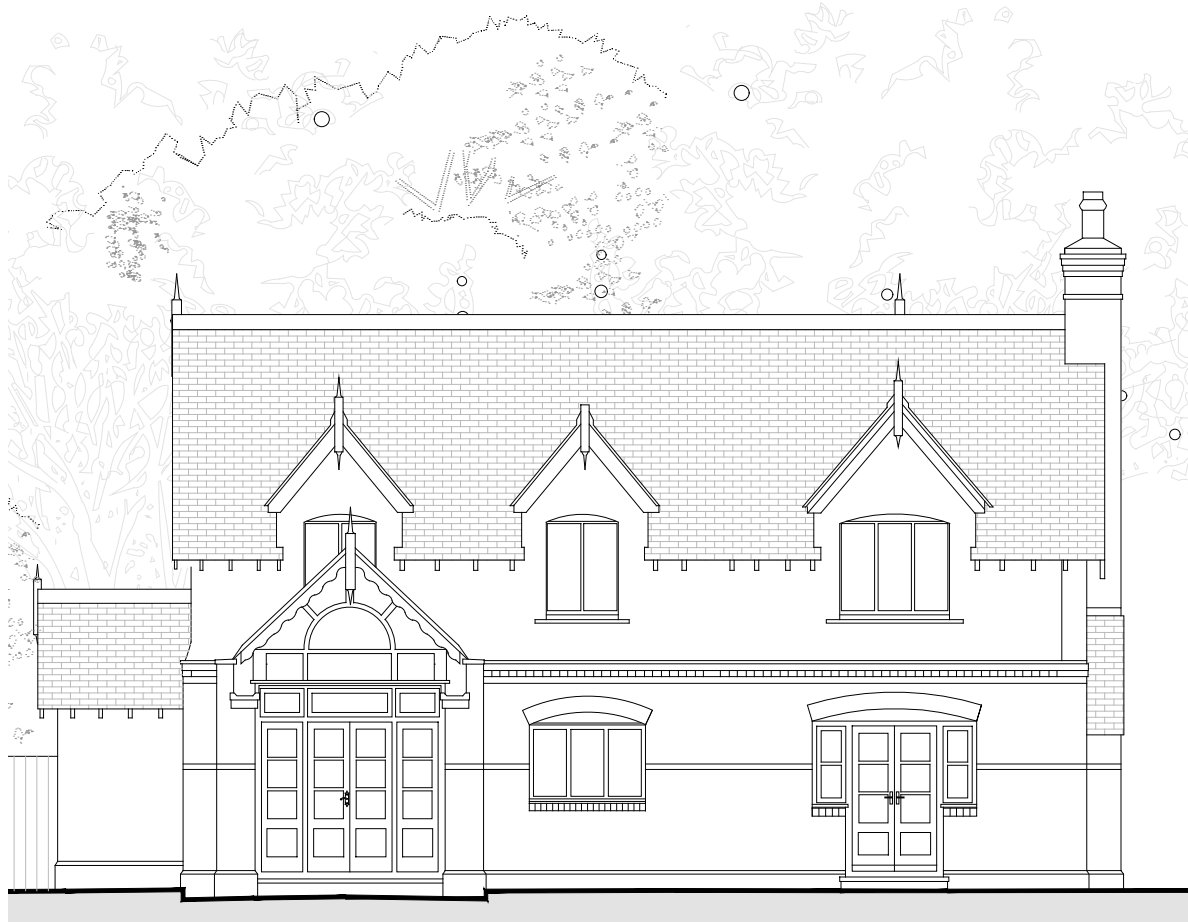
Existing Rear Elevation (South)