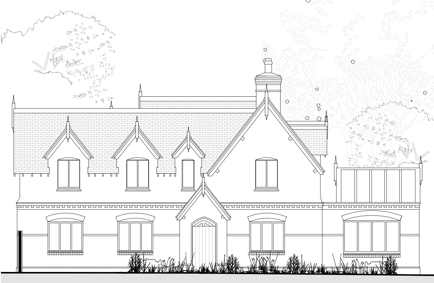
Existing Side Elevation (West)