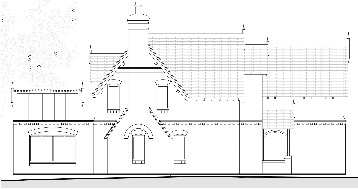
Existing Side Elevation (East)