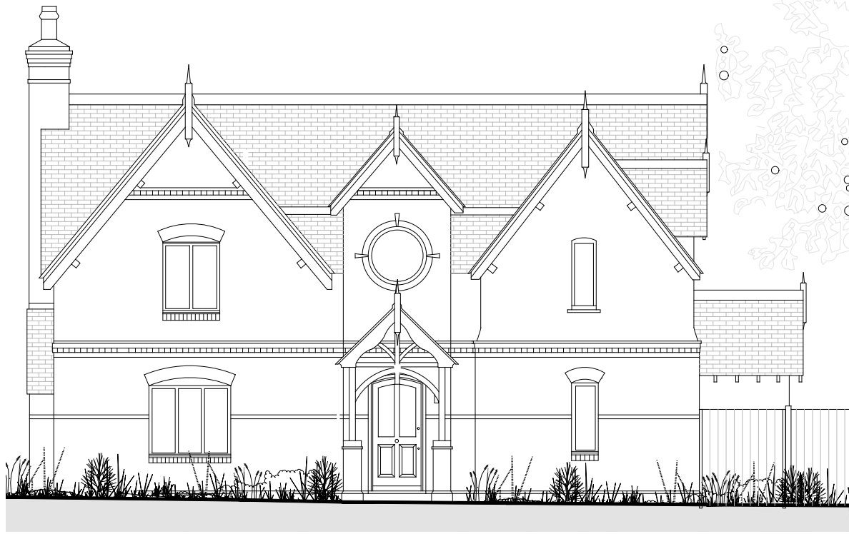
Existing Front Elevation (North)