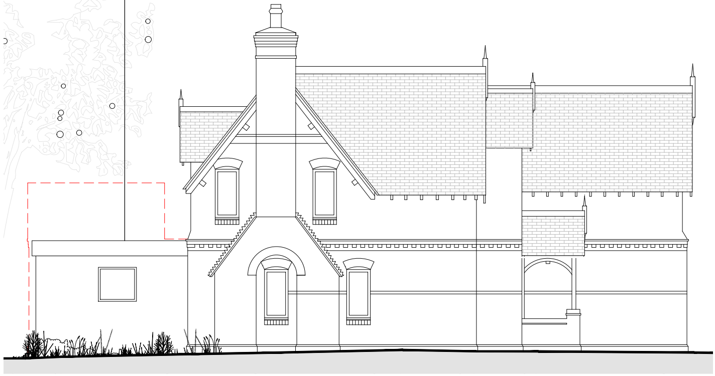
Proposed Side Elevation (East)