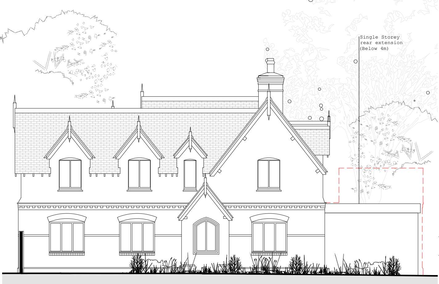
Proposed Side Elevation (West)