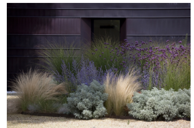
LIGHT GREY PORCELAIN